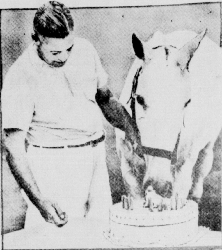
Old Bill Meadows, famed army polo pony, gets a cake topped with 23 figurine carrots as he is retired at Governors Island, New York, with fitting ceremonies.