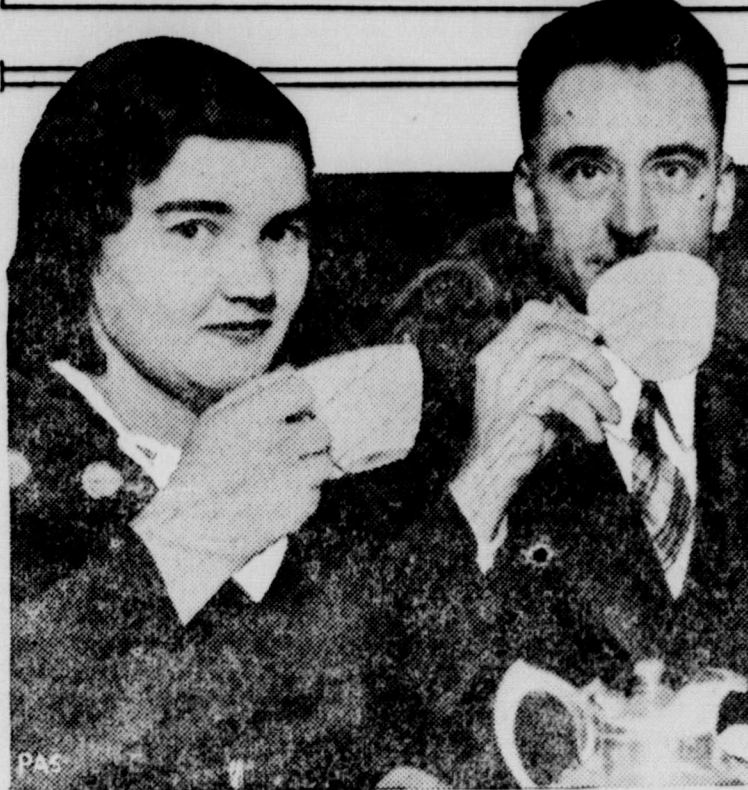
CHICAGO... Above are Mr. and Mrs. Olive Dionne, parents of the famous Canadian quintuplets, who were prevailed upon to come down to the United States and enjoy the hospitality of America's "Windy City."