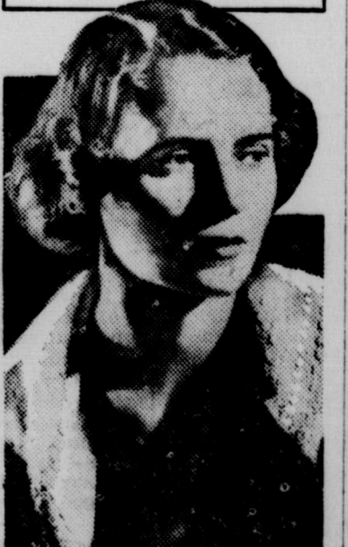
NEW YORK... A new picture of Mrs. Paul Mellon, bride of the son of Andrew Mellon, former secretary of the Treasury and Ambassador to Great Britain. Mrs. Mellon was the former Mrs. Mary Conover Brown of Kansas City.