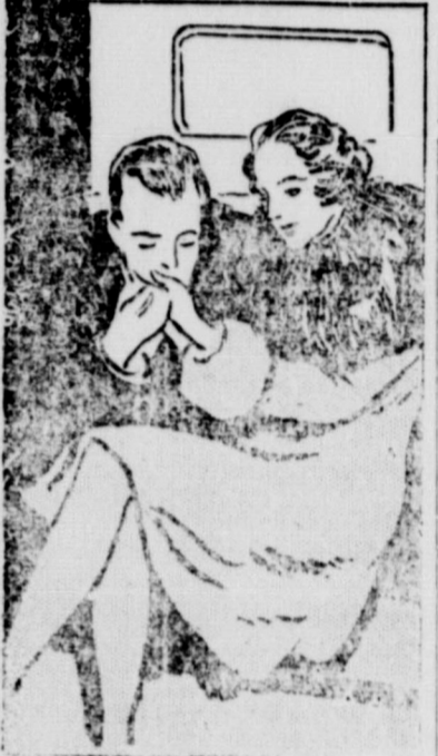
—and his lips were pressed hotly against the palms of those hands.

know I'm what is, technically, called 'nice'?