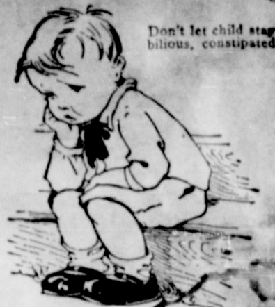
Don't let child stay bilious, constipated

The Sultan's departure was announced by the British dreadnought Malaya.