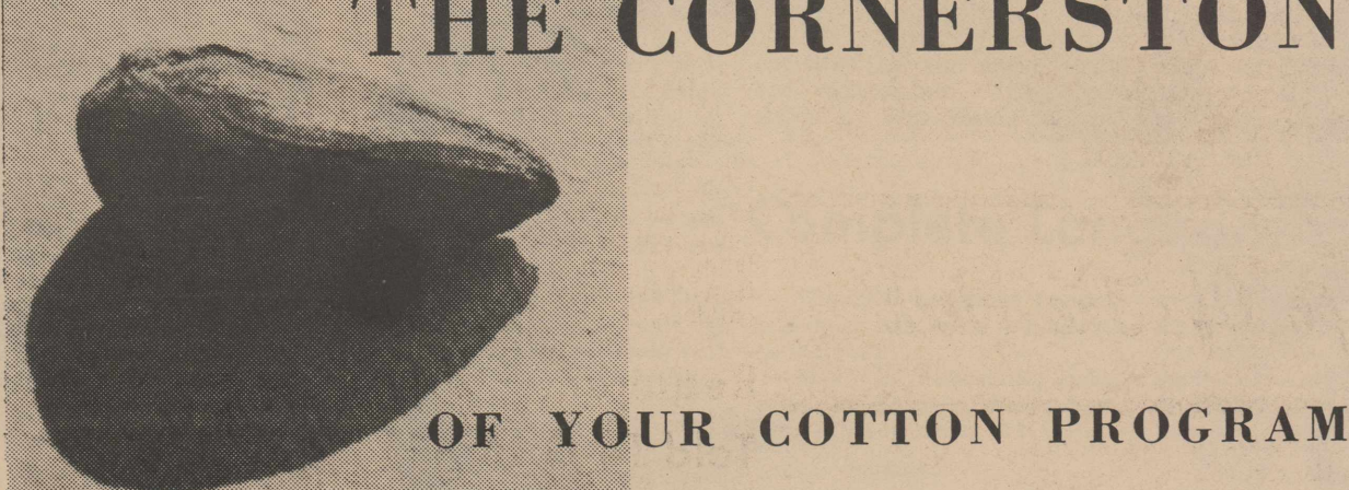
a special message for the cotton producer who wants to make more money

Are we exaggerating? Giving too much credit to the least cost item in your entire cotton production program? University researchers don't think so. Their studies show that quality of planting seed definitely affects net profit; that most "farmer saved" seed is decidedly inferior to pure seedstock, by as much as 116 pounds of lint an acre in some cases. Think about it. You can do two things to make more money: improve your product and lower production costs. The only common link between the two is quality seed.