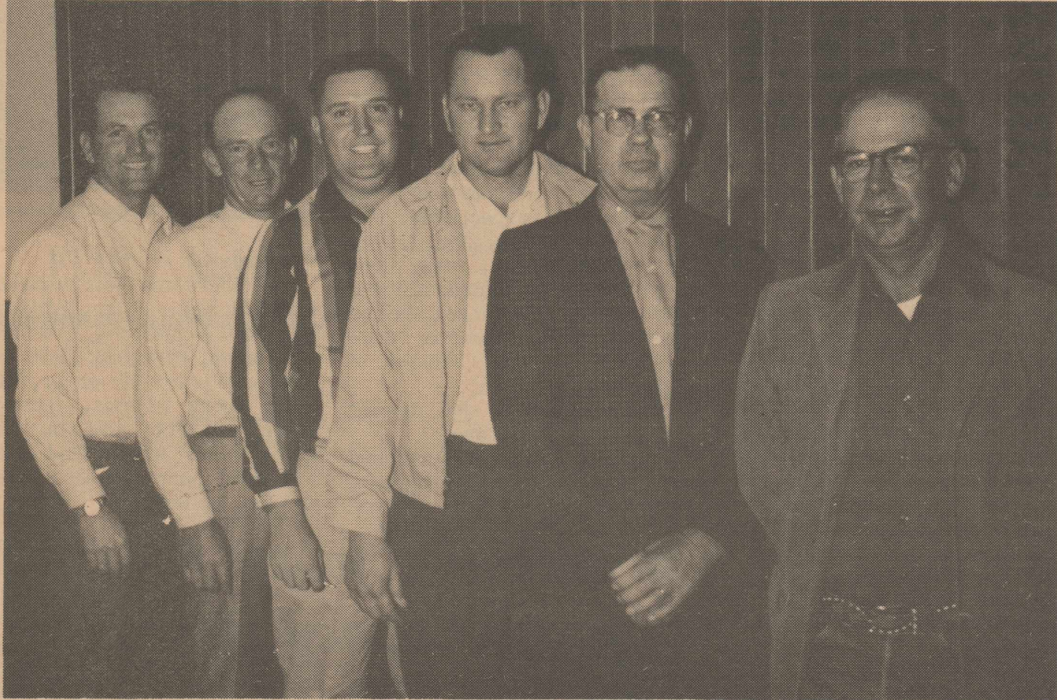
LOCAL FARMERS JOINED NFO County Chapter becoming charter members of the group when they met in Dimmitt Tuesday morning for the purpose of chartering the organization in the county of Castro.