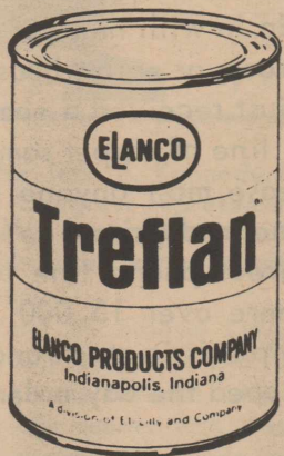
(Treflan ® —trifluralin, Elanco)

Apply Treflan ® this fall and help protect yourself against another wet spring!