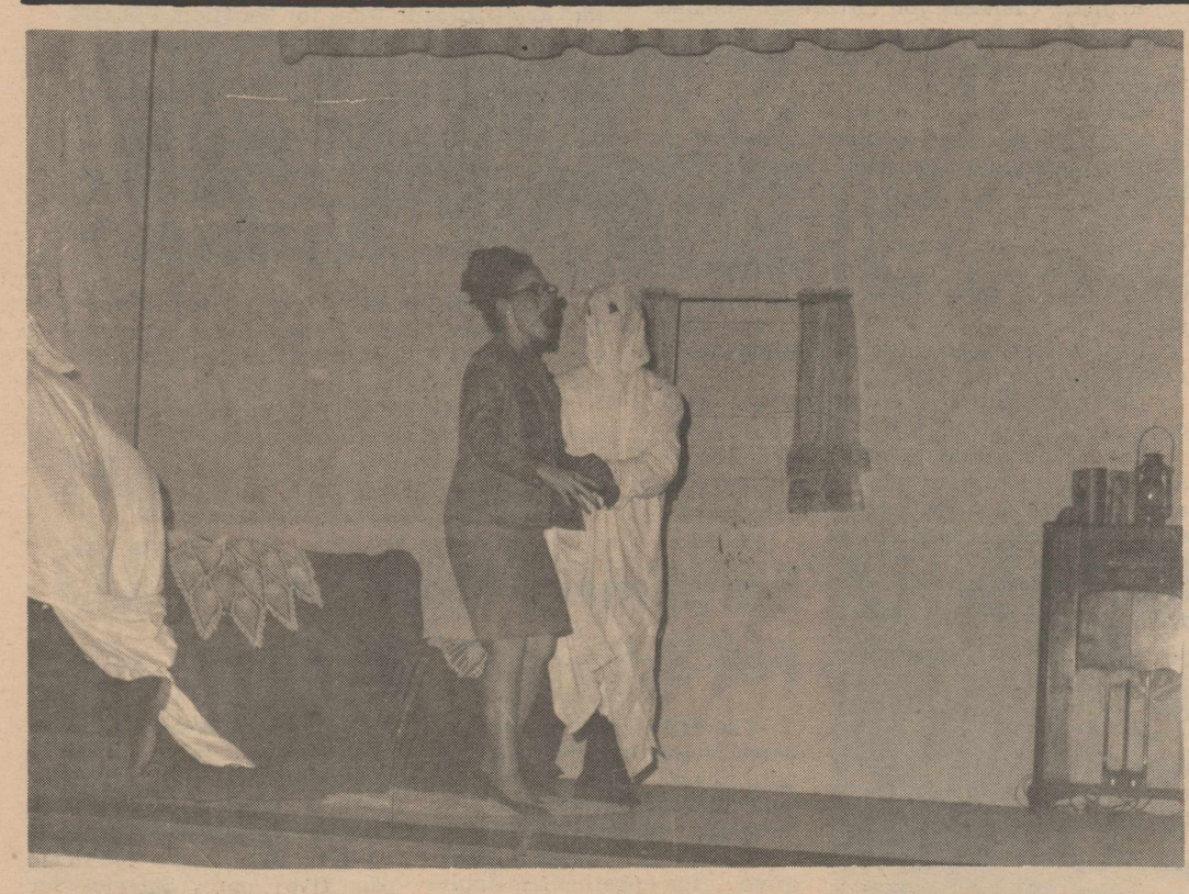
HOBGOBLIN HOUSE--The junior class presented a three-act comedy here Thursday night to a large audience. Here is a scene from the play in which one of the characters is scared by some