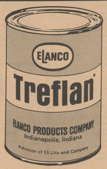
(Treflan * -trifluralin, Elanco)

Don't forget: there is an alleged problem. We are checking into it. And, if the facts warrant, there will be action. Only by hearing from each citizen can we be sure that what will be done will mirror the wishes of a majority of Texans and this District.