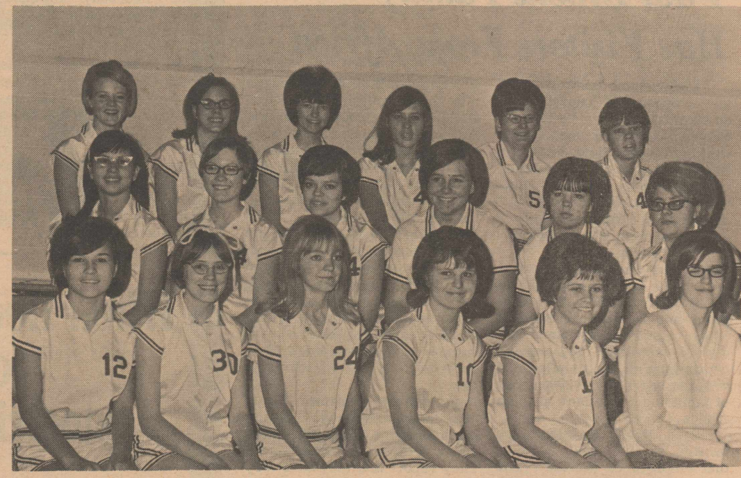
B-TEAM GIRLS BASKETBALL TEAM