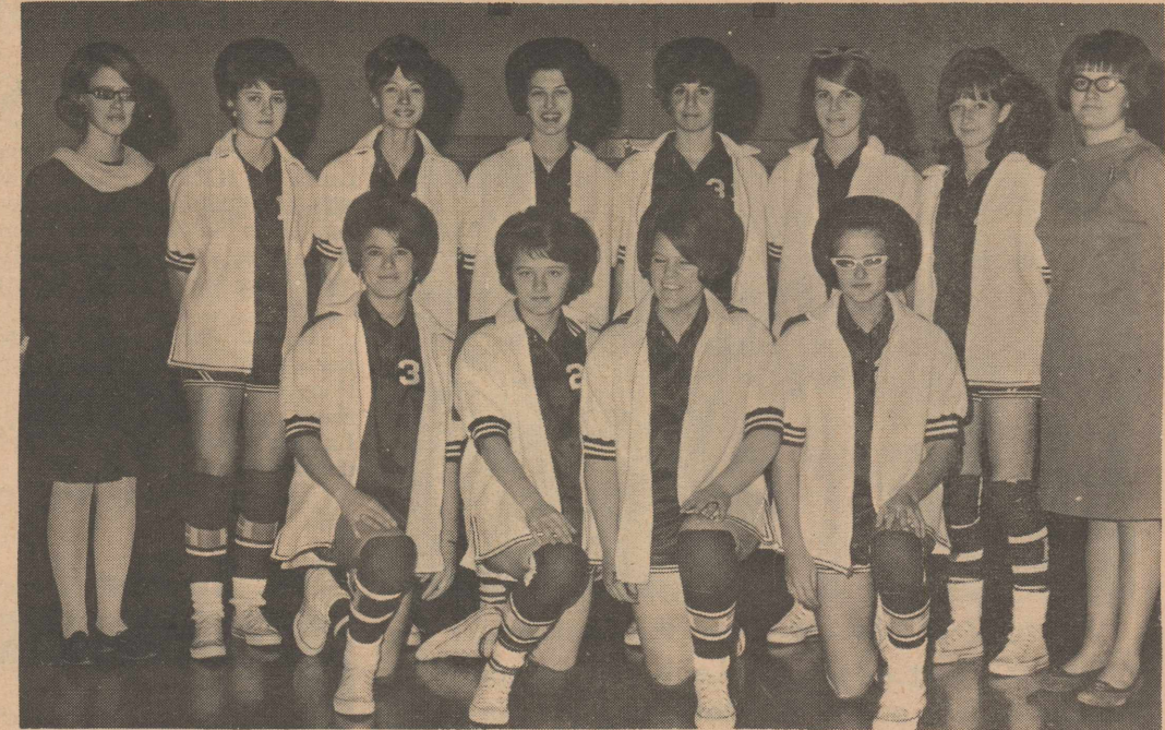
VARSITY GIRLS BASKETBALL TEAM

l egg Combine ingredients and mix well, add 1/2 cup milk 1 package lime jello. Mix and mix. Chill 2 hours or overnight if possible, Shape into walnut sized balls. Heat 4 tablespoons shortening and brown meat balls slowing until well done. Remove the balls from the fat. Stir into the fat the follow-Let the other half of the jello ing: 4 tablespoons flour, Itable-spoon paprika, 1 1/2 teaspoon salt, 1/8 teaspoon black pepper. Add 2 cups boiling water, cook until smooth. Heat meat balls cream a little at a time. Serve with noodles or rice. (Makes When ready to serve un- 18 meat balls.