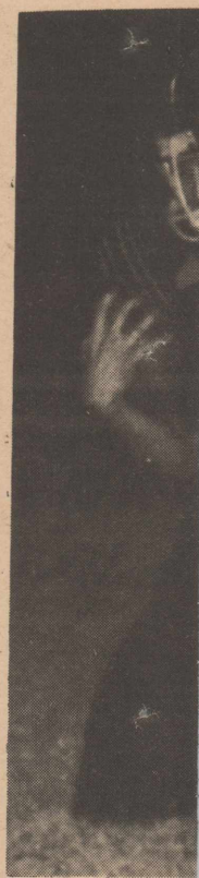
COWBOY IN TR of action, as L

The Cowboys managed to drive to the Hart five before a