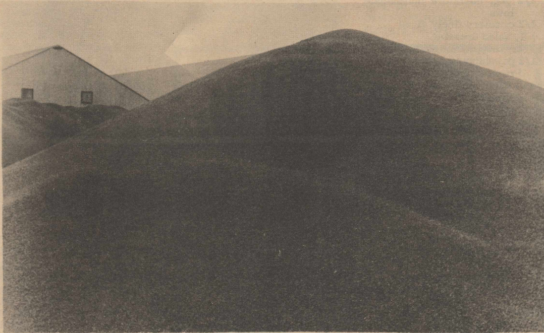
A MOUNTAIN--OF GRAIN---That's the picture of part of a probable record harvest of milo in the Hart area this year. The picture was taken in the southwest part of Hart. Total grain receipts aren't in yet, but area elevator operators say the total may be a new high.