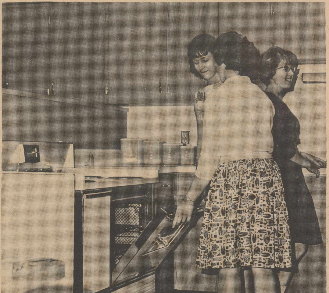
NEW HOME EC ROOM--FHA girls are admiring the new appliance that were recently put in the homemaking room.

The winsome lass above is appearing on more than 200 outdoor billboards over the State of Texas during the month of April. This salute to F. H. A. Week is sponsored by the Future Homemakers of America, Texas Association, and Texas Electric Cooperatives, Inc. The Outdoor Companies of the State are donating the sign space for the showing.