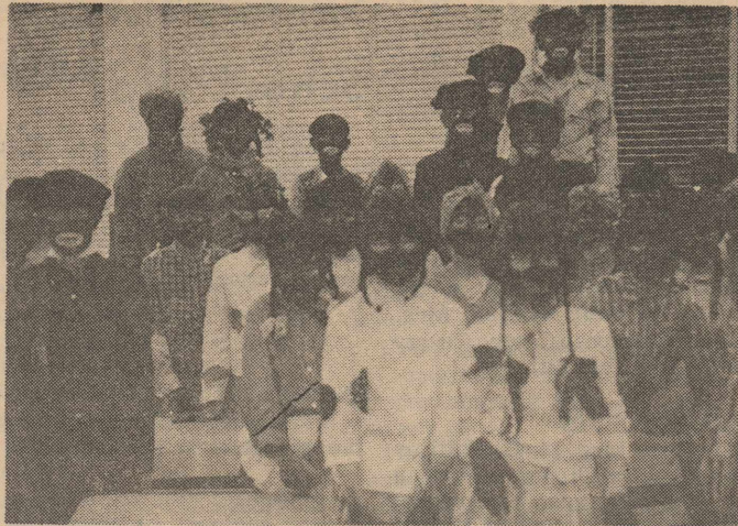
HART fifth grades presented a Negro Minstrel Tuesday night at the last PTA program of this year. Every student in the