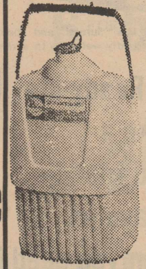
SUPERTHERM 1/2 GAL SIZE VACUCEL INSULATED 98¢