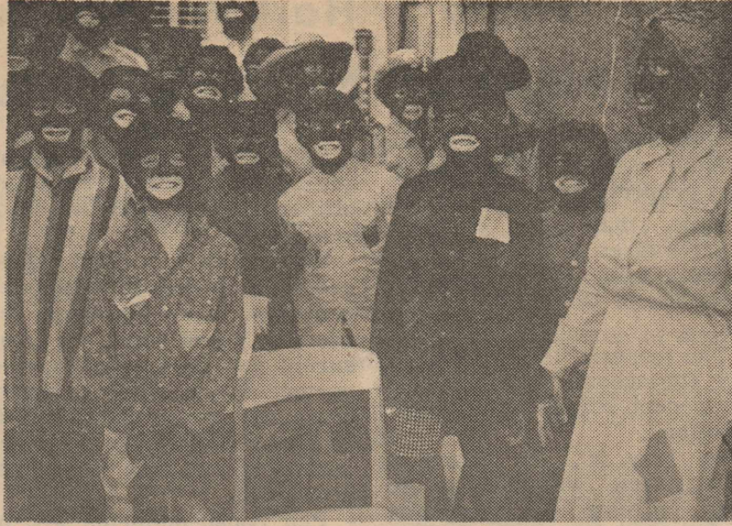
two fifth grades participated. One of the largest groups of the year attended the presentation.