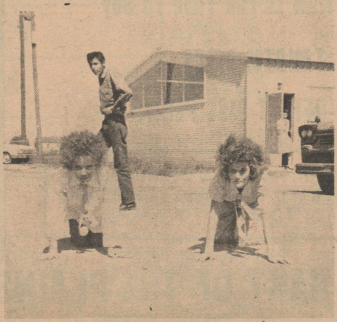
INITIATION WEEK--Shown here are photos taken during initiation week at Hart High School. These lovely young ladies are all freshmen at the school.