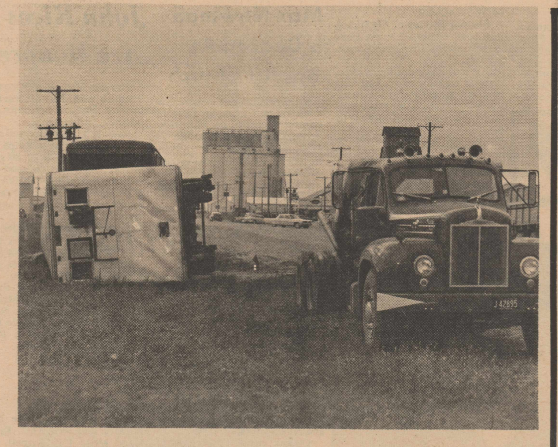
THIS TRUCK-TRAILER flipped over on its side Monday night in an accident near Hart Grain Co. The trailer was loaded with potatoes. For story, see page 1.