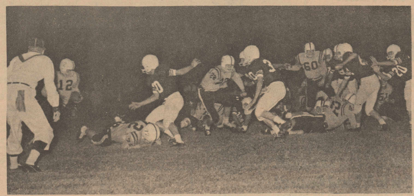
HERE'S ACTION from the Hart-Kress football game last Friday night in Longhorn Stadium. Hart fell to the heavier Class A Kangaroos, 37-0. The loss ran the Longhorn