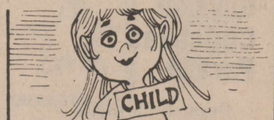
In old England, the word "child" referred only to a girl.

Friday November 16 the girls beat River Road 64 to 36. Sasha scored 16 pts. Jolina 13 pts. and Marsha Diamond 13 pts. Stephanie Gray had 7 rebounds, Jolina 7, Buffy Ellison 6, Sasha 5 and Marsha 6.