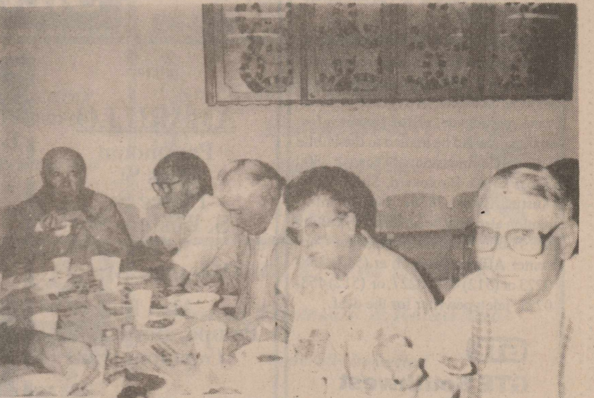
The Scot Depression Bean Supper was well attended Saturday night November 24th at Scot Hall. Shown above is just part of the crowd that ate well during the evenings festivities.