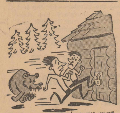
Y-Y-YOU MEAN YOU HAVEN'T GOT THE KEY?" play safe!