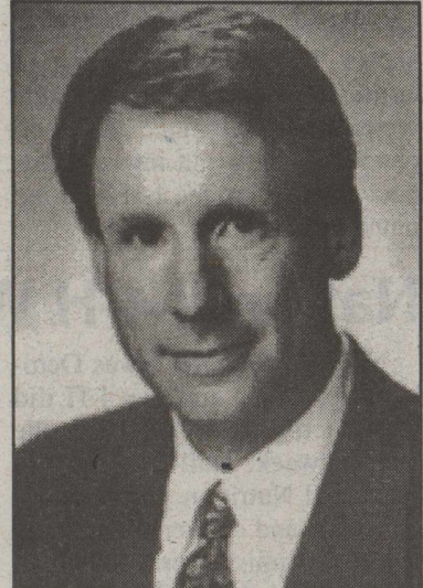
State Senator Robert Duncan