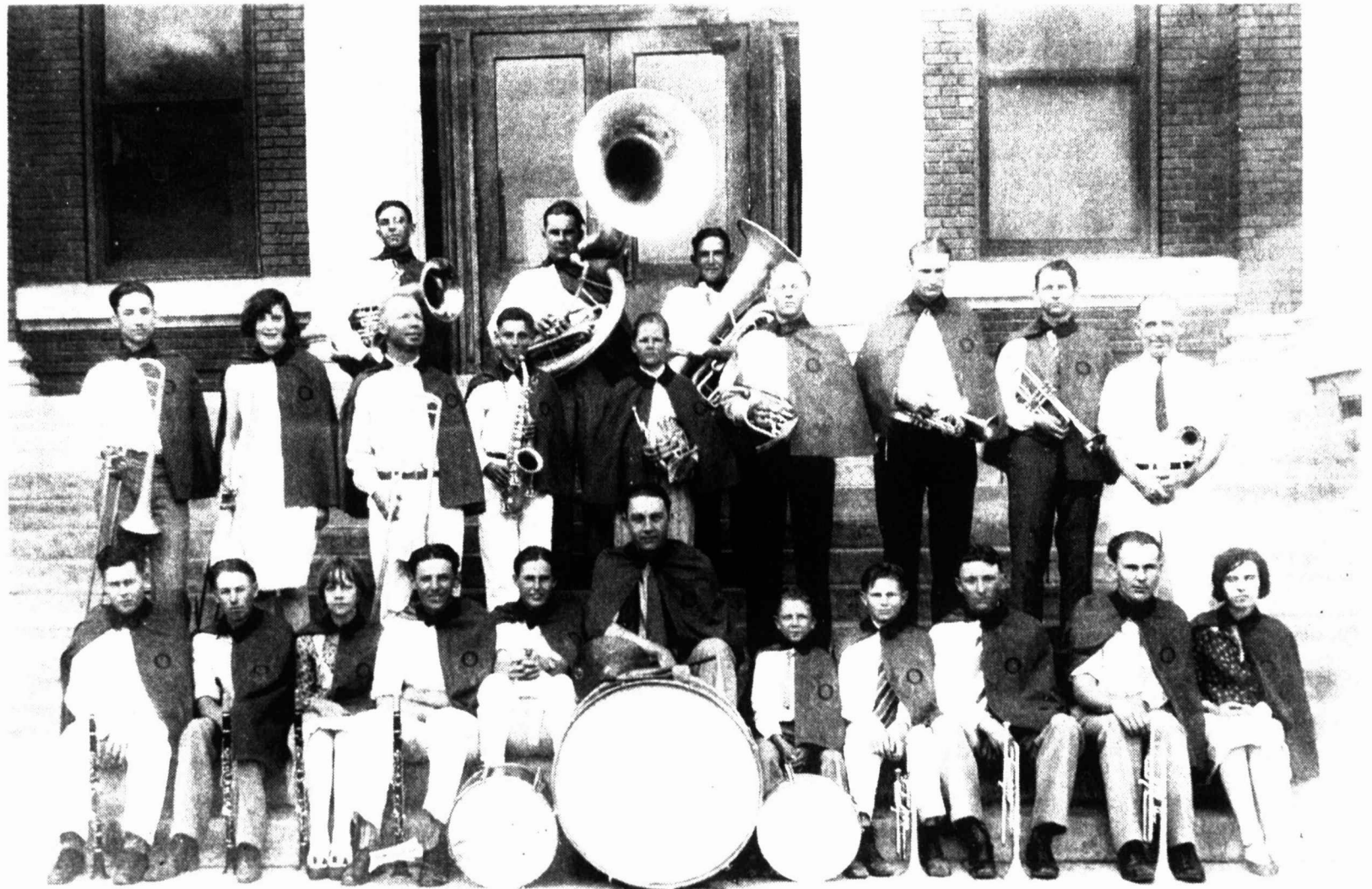
TAHOKA MUNICIPAL BAND 1928 - Tahoka Museum