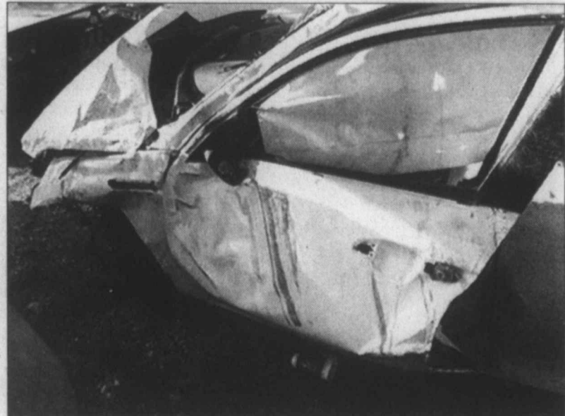
Driver injured ... The driver of this vehicle suffered injuries in a one-vehicle rollover in the early morning hours on Sunday on US 87 near O'Donnell. The driver was reportedly trapped inside the heavily-damaged vehicle, requiring assistance from first responders to free him from the vehicle. He was transported by EMS to a Lubbock hospital.