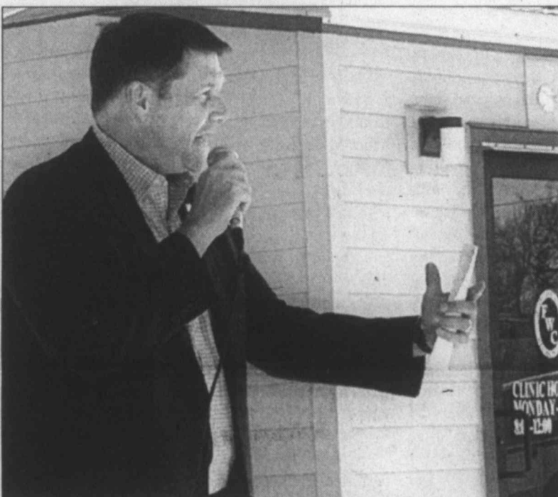
Congratulations... Congressman Jodey Arrington was the guest speaker at the grand opening of LCHD's new O'Donnell Clinic last Thursday afternoon, congratulating Lynn County Hospital District on their new facility.