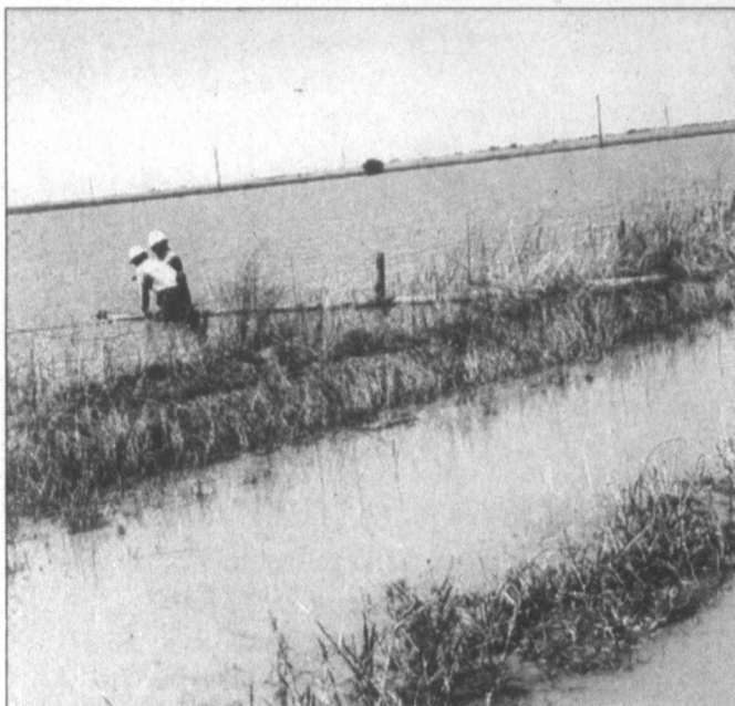
Outages... High winds and heavy rainfall were to blame for many outages in Garza from storms that came through Lynn, Garza and Borden counties last Thursday evening. Wind speeds in Lynn County were measured at 65 mph, and 94 mph in parts of Garza County. Pictured are Lyntegar employees working near Graham area south of Post to restore outages in the area. Some of the poles were down in standing water, with some reports of employees wading through water that was almost waist high, and even chest deep in one area.