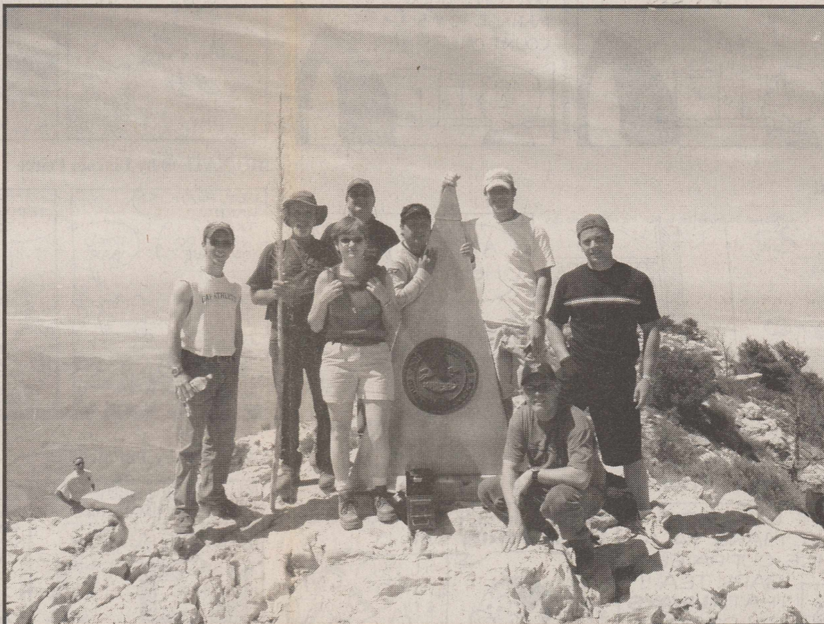
The top of the world (or at least the top of Texas)

Phi Theta Kappa is the International Honor Society of the Two-Year College which emphasizes the four hallmarks of Scholarship, Leadership, Service and Fellowship.