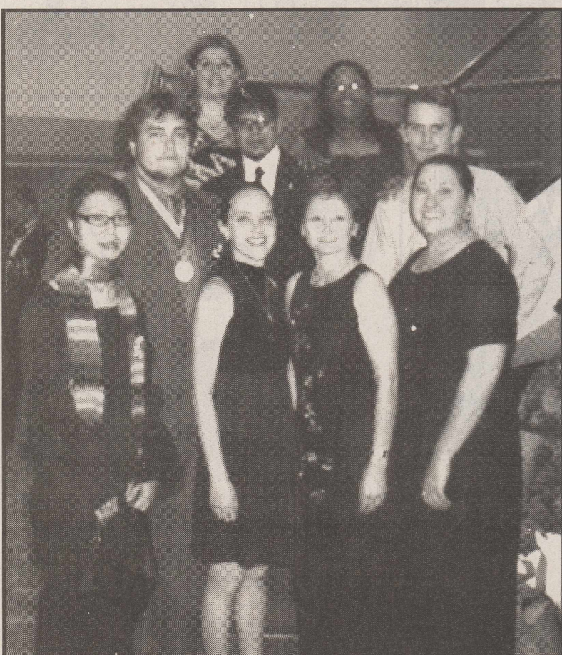
Honor Society members attend International Convention