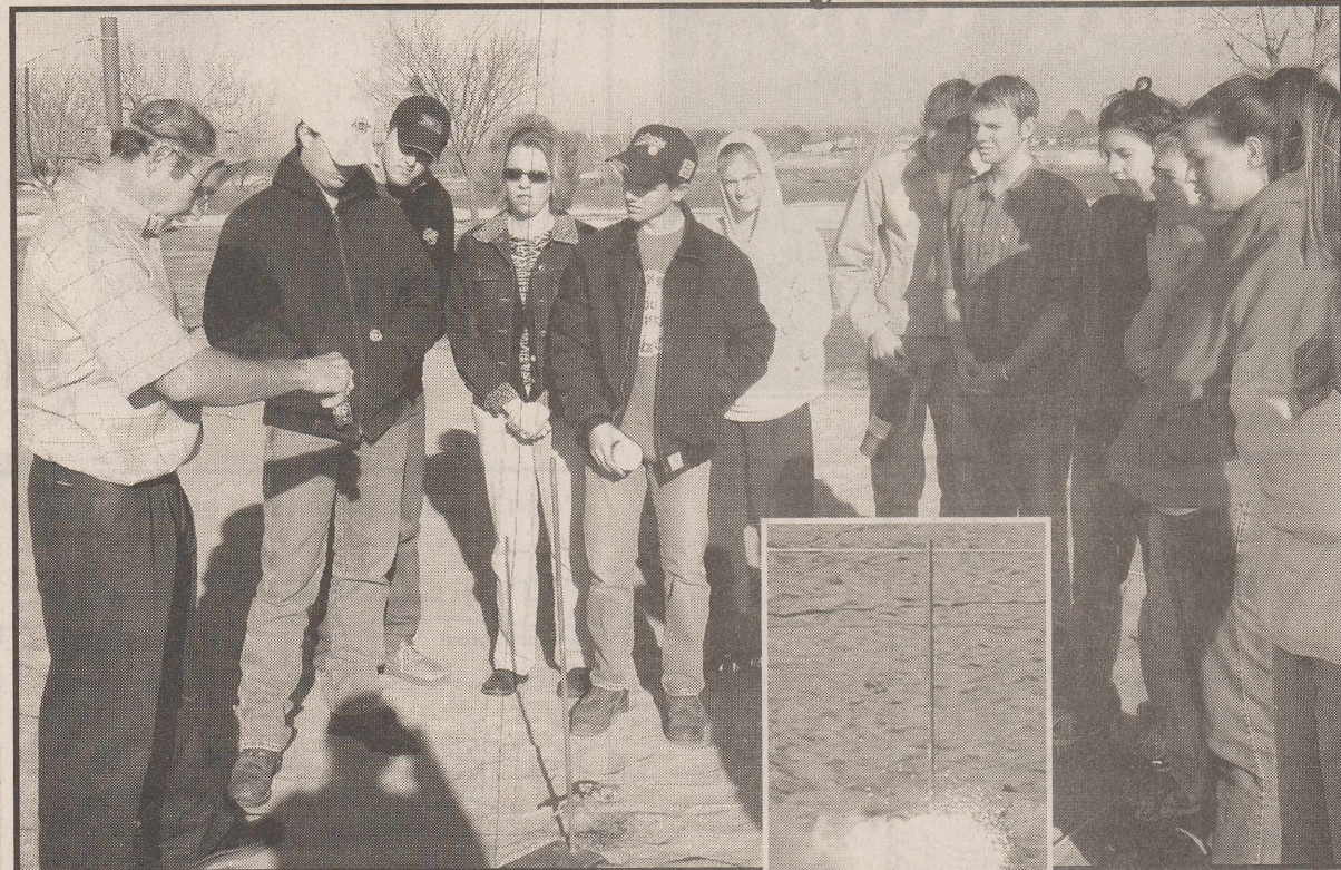
Thermite reaction produces heat in excess of 3000° C