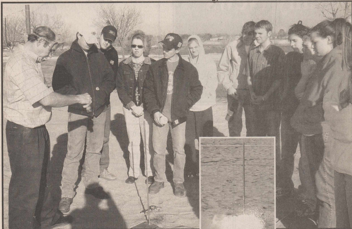
Thermite reaction produces heat in excess of 3000° C