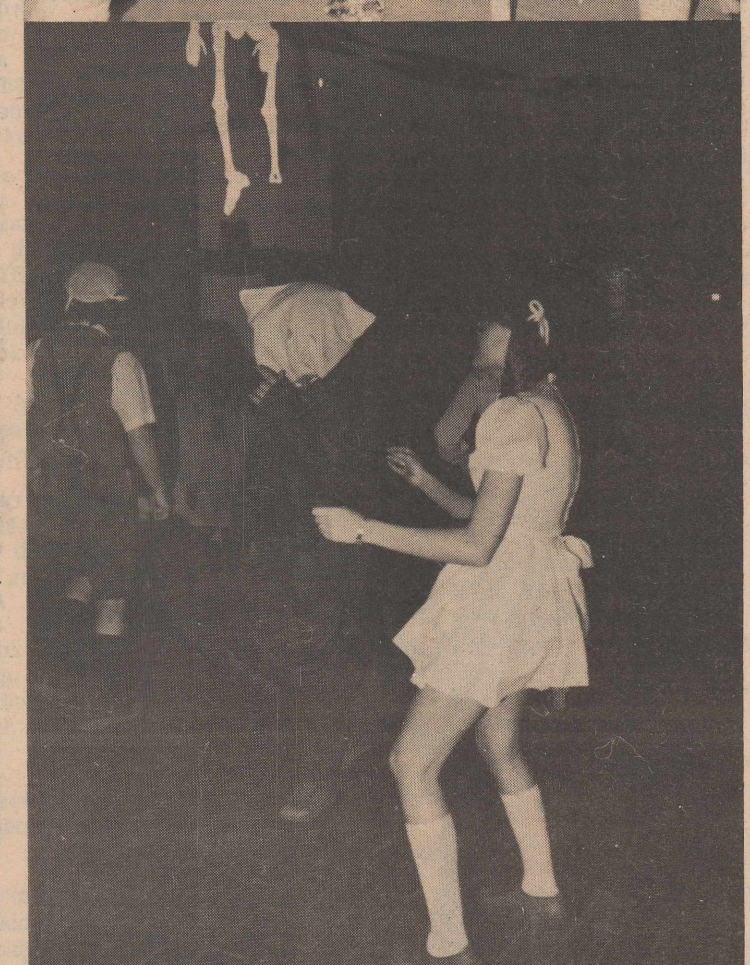
GET DOWN GOBLINS! - There wasn't a full moon Halloween night, but all the ghastly, gorey ghouls made their appearance at the WTC Halloween Extravaganza in the cafeteria.