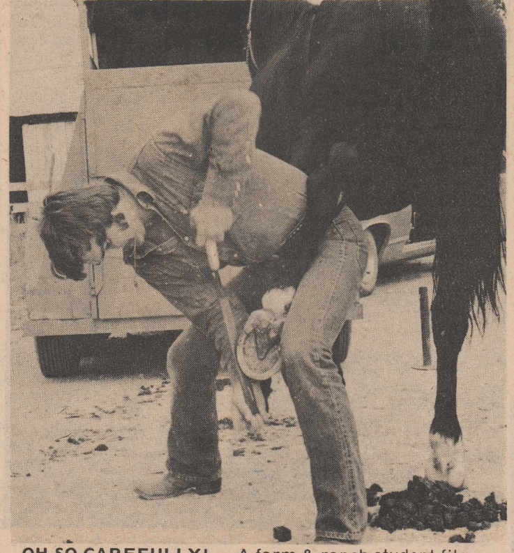
OH SO CAREFULLY! - A farm & ranch student files a horseshoe as part of his work on a nearby ranch. (photo

To date, the following organizations have provided scholarships: The Chronicle of Higher Education. The Ford Foundation, The Forum for the Advancement of Students in Science and Technology, Inc., and The International Study Travel Center, Inc. The College Entrance Examination Board has contributed toward project evaluation activities.