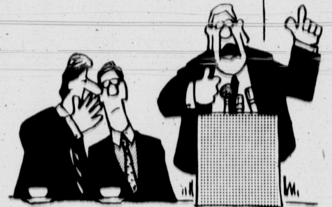
"Iacocca has Operation Airbag — WE have Operation Windbag!"