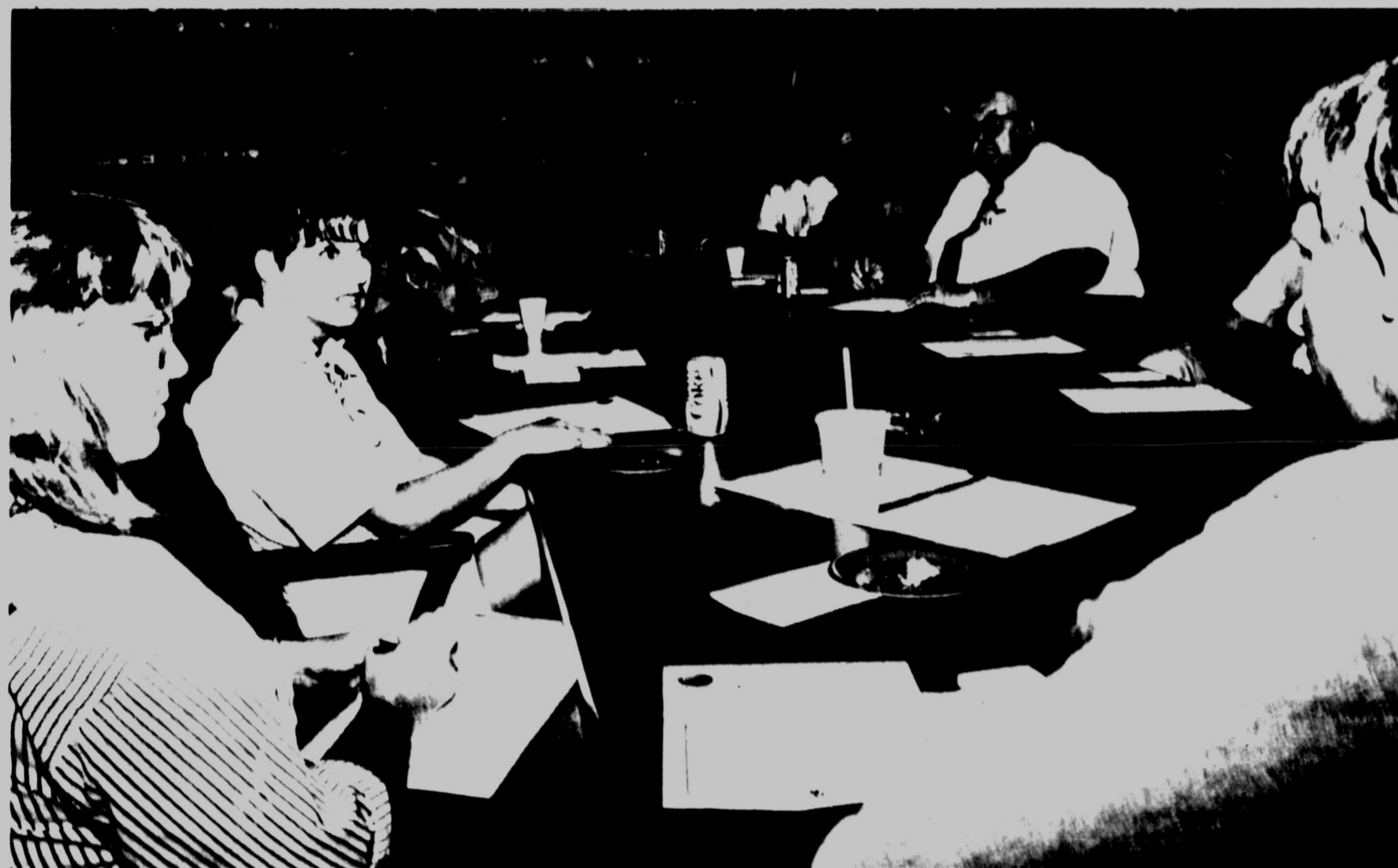
FOR THE FOURTH — Chamber of commerce Fourth of July committee members met Thursday afternoon to discuss the wide variety of events that are planned for the celebration this year. Queen con-