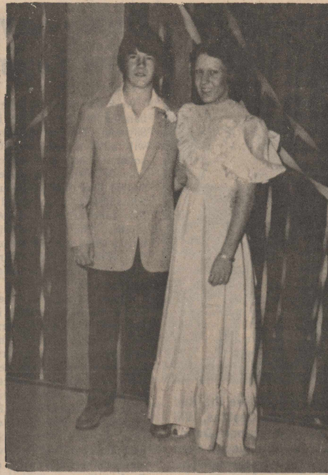
Dallas Couple Has Twin Girls