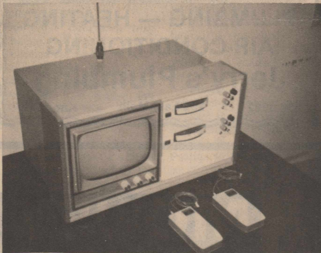
A REPLACEMENT for the Knox County Hospital's patient monitoring system is shown.