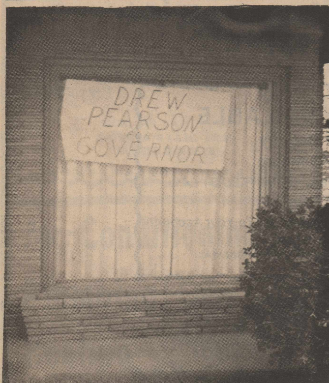
EXPRESSING THE sentiments of many football fans in Knox City following the spectacular Dallas Cowboy game Sunday afternoon was this sign in the window of CableVision offices Monday morning, "Drew Pearson For Governor"!

The nursery will be open and the community is invited