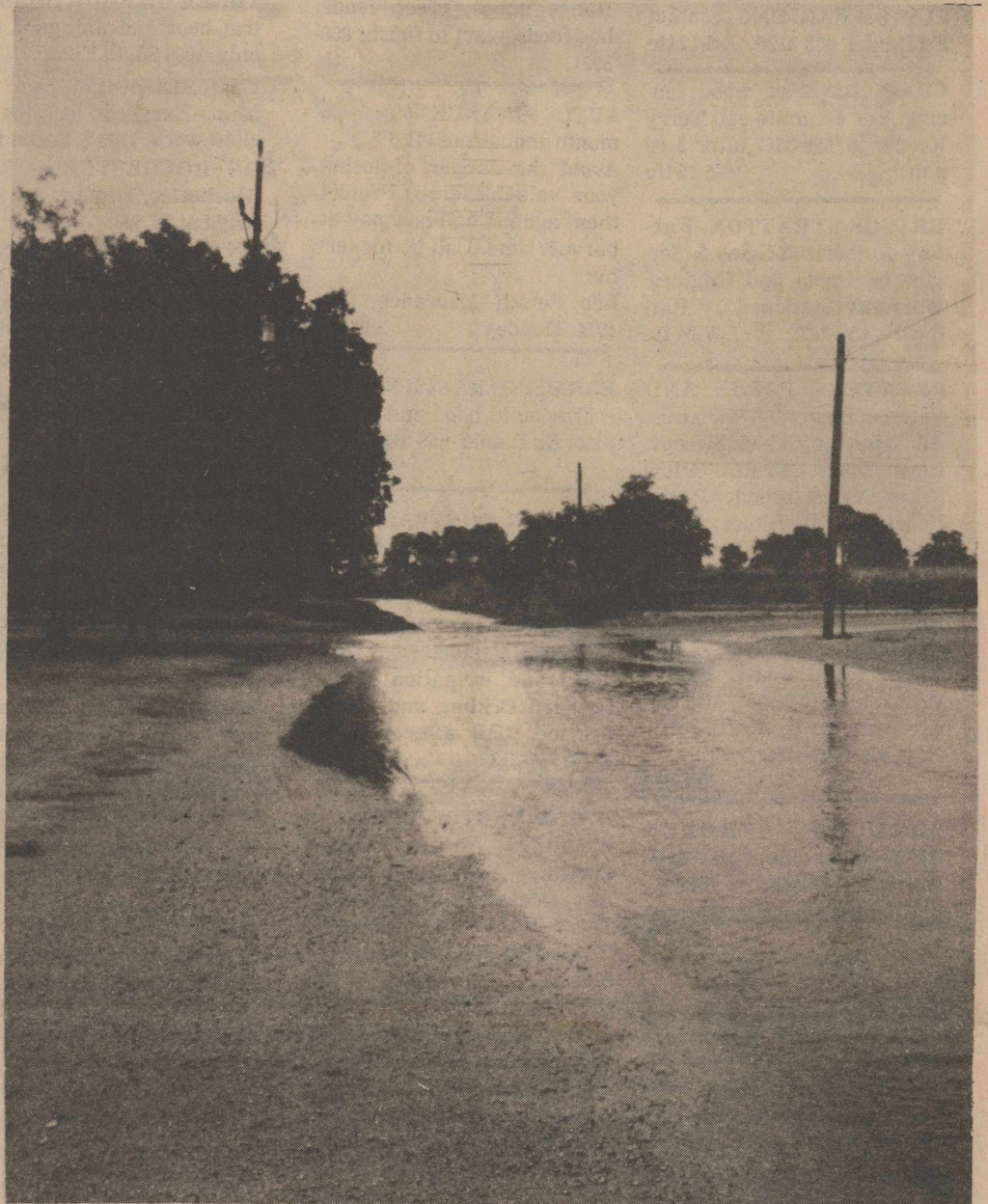
IT CAN RAIN and did for a few minutes in Knox City Sunday afternoon when a hard shower dumped .7 in town. However, the thundershower was limited to a small area, but did cool the hot, hot temperatures down for a few hours. The drainage ditch on the north end of Avenue B, pictured here, has recently been cleaned by city employees and everyone is hoping that it has a chance to fill up soon!

Remember curtain goes up at 8:00 o'clock Thursday night.