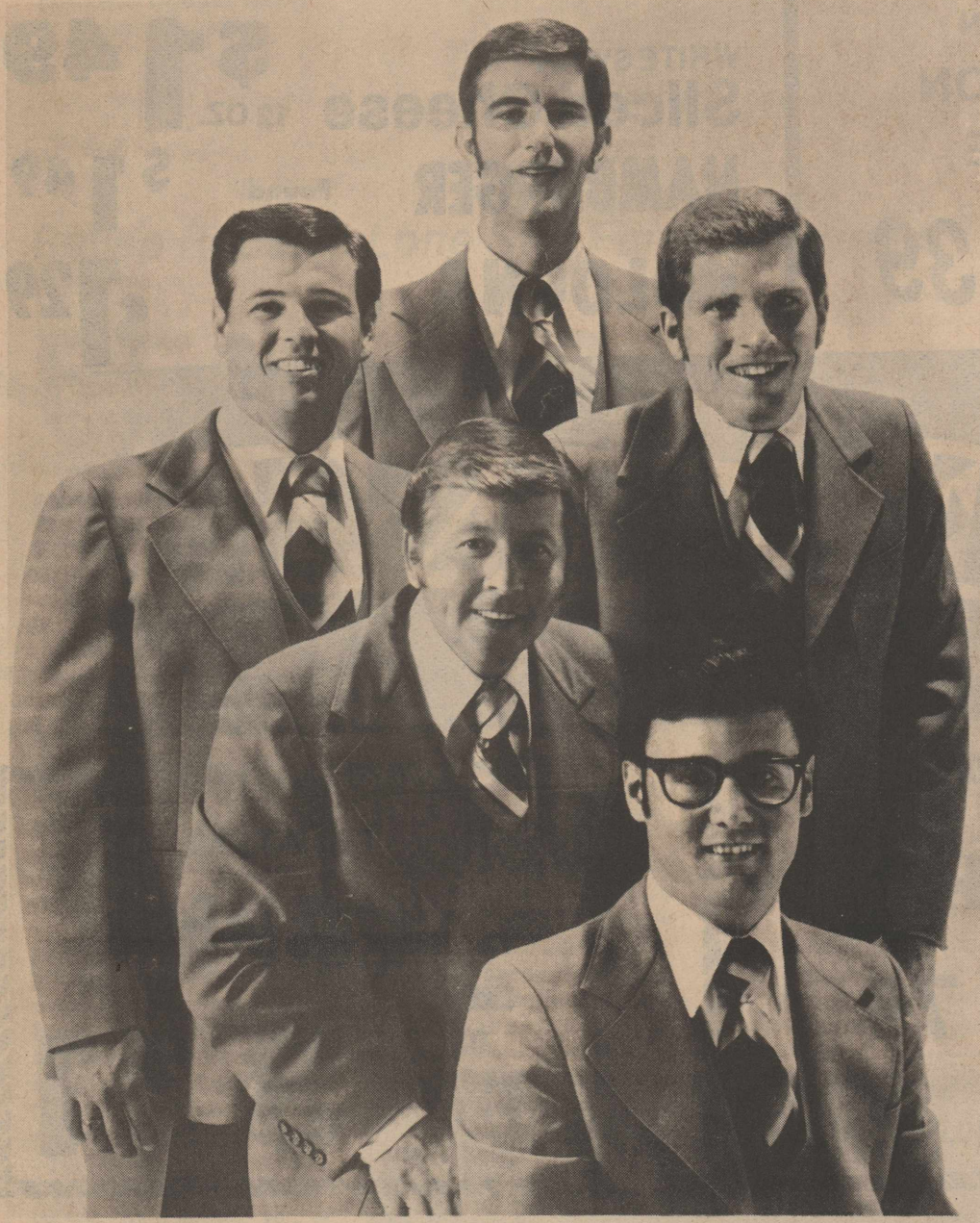
THE MASTER'S FOUR Gospel Quartet will be among the entertainers to appear Thursday night in Munday High School Auditorium when the famed Grapevine Opry presents a benefit show for the Knox County Hospital Auxillary. The fantastic quartet has the ability to present a song with such impact that it reaches the hearts of those in the audience. These dedicated young men, shown with their accompanist, are involved with concerts, church services, revivals, radio, television, and any means to fulfill their goal. "Telling The World About His Love."