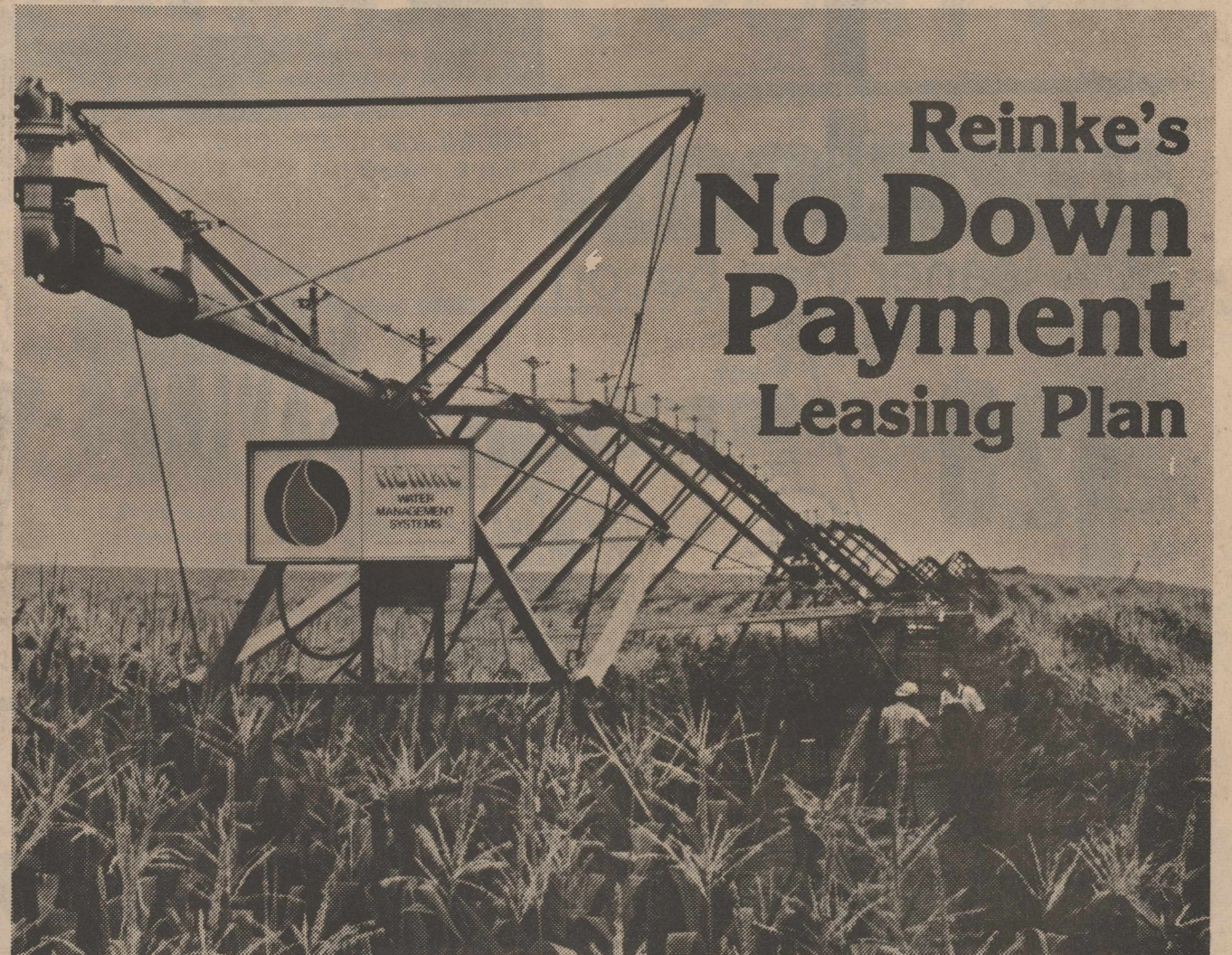
The Minigator® Kwik-Tow, one of the eleven models available for leasing.