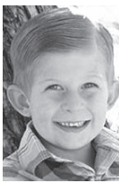
the cub reporter by benjamin estlack

We are now planning to sleep in the box fort sometime over night before we get too crowded with homework and other projects.