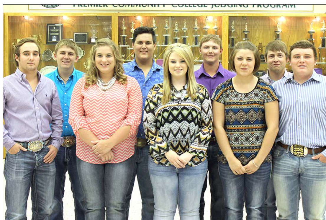
The Clarendon College Livestock Judging Team.