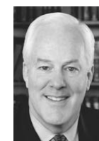
texas times by sen. john cornyn

Three out of every four saddles from the shop are custom-made down to each stitch, and if you're in the market for one, you'll have to wait your turn. While it takes about a week to craft a