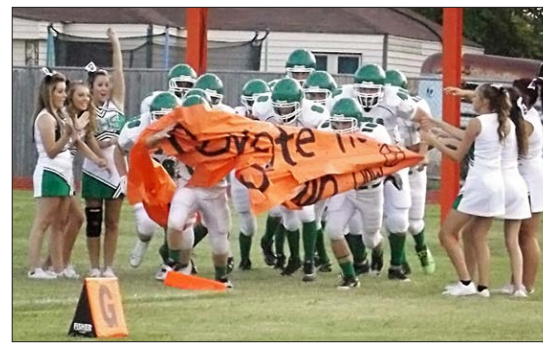
The Owls take the field for their game Friday against Higgins.