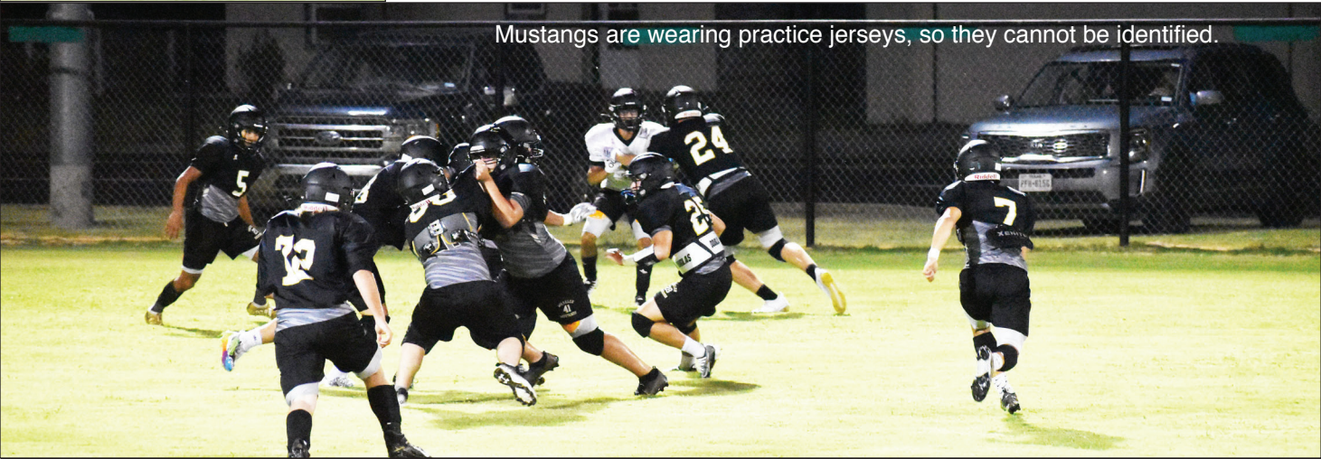
Mustangs are wearing practice jerseys, so they cannot be identified.