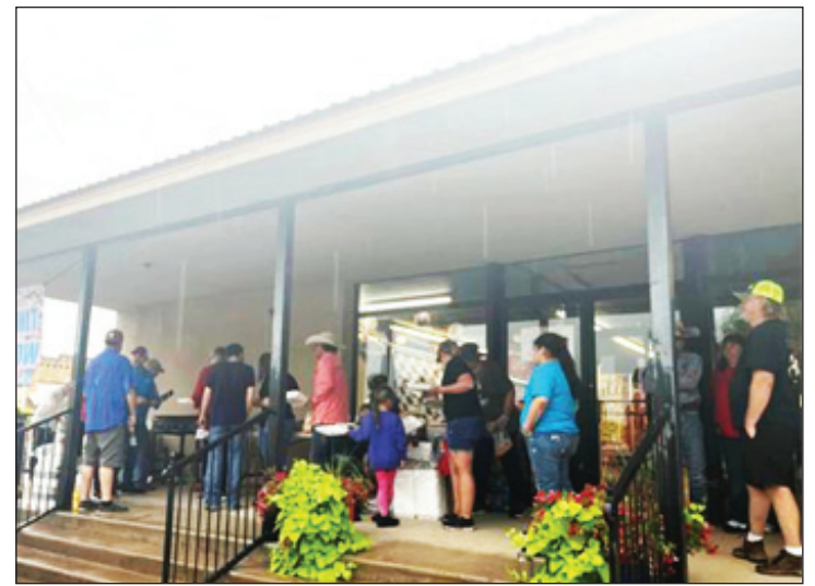
Lined up for Capital Farm Credit Hamburgers