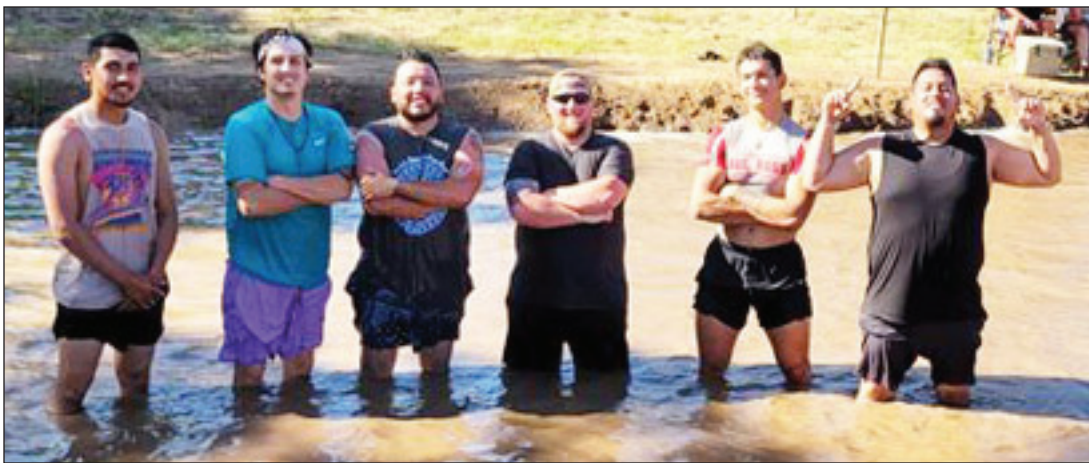
Mud Volleyball, First Place - Notorious M.U.D.