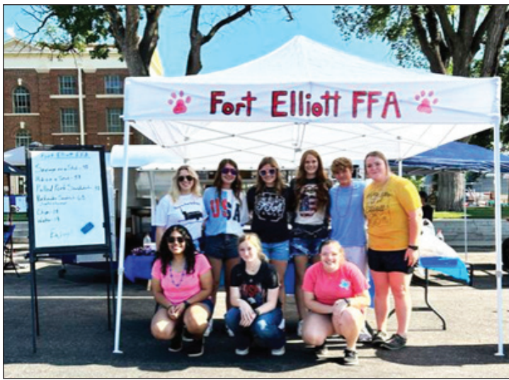
Fort Elliott FFA