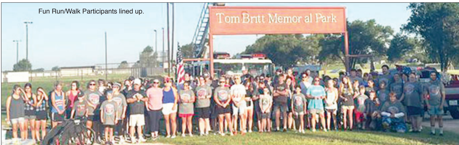
Fun Run/Walk Participants lined up.