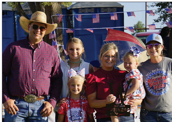
Business of the Year — Koepe Sales & Koepe Legacy Insurance