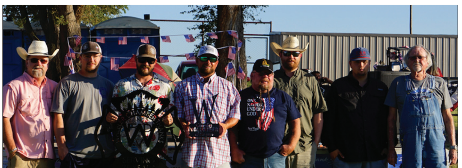
Volunteers of the Year — Wheeler Volunteer Fire Department—75th Anniversary