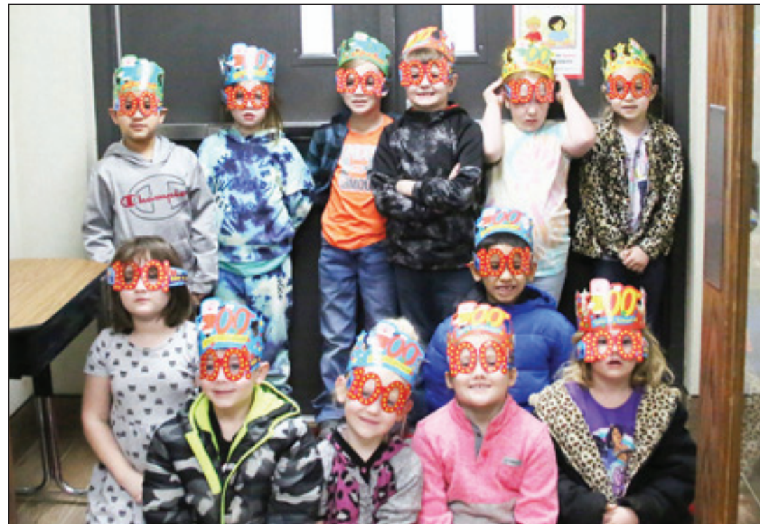
Fort Elliott 1st grade celebrated "100th Day of School" by bringing 100 items and grouping them by 10s.