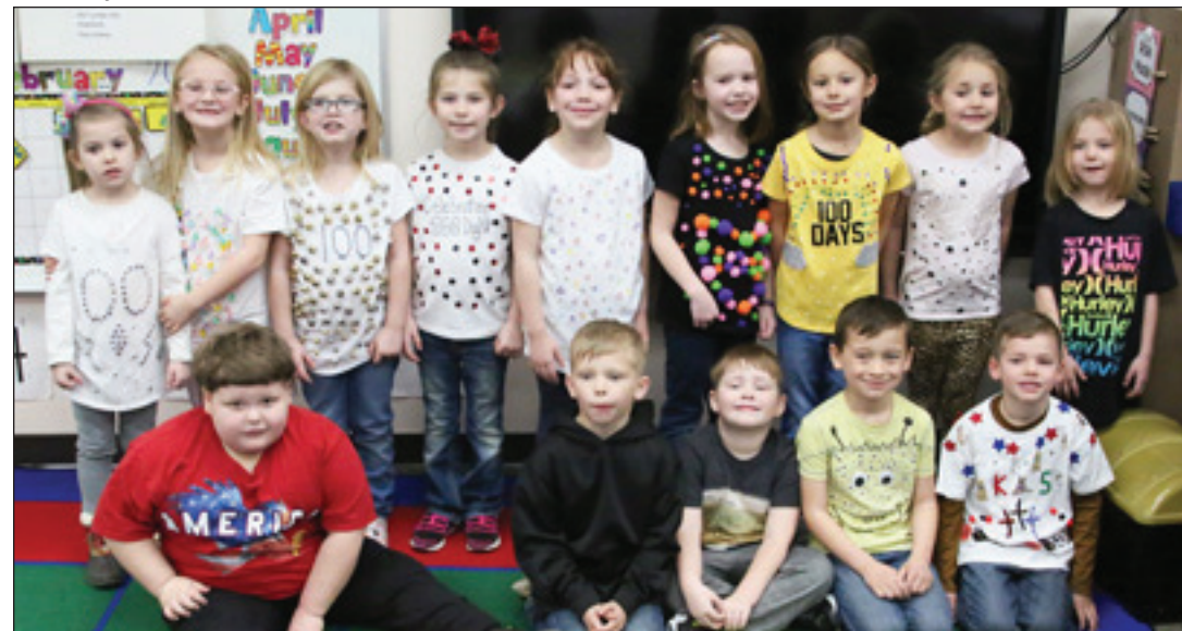
Fort Elliott Kindergarten celebrated 100 Days of School by putting 100 things on a shirt.