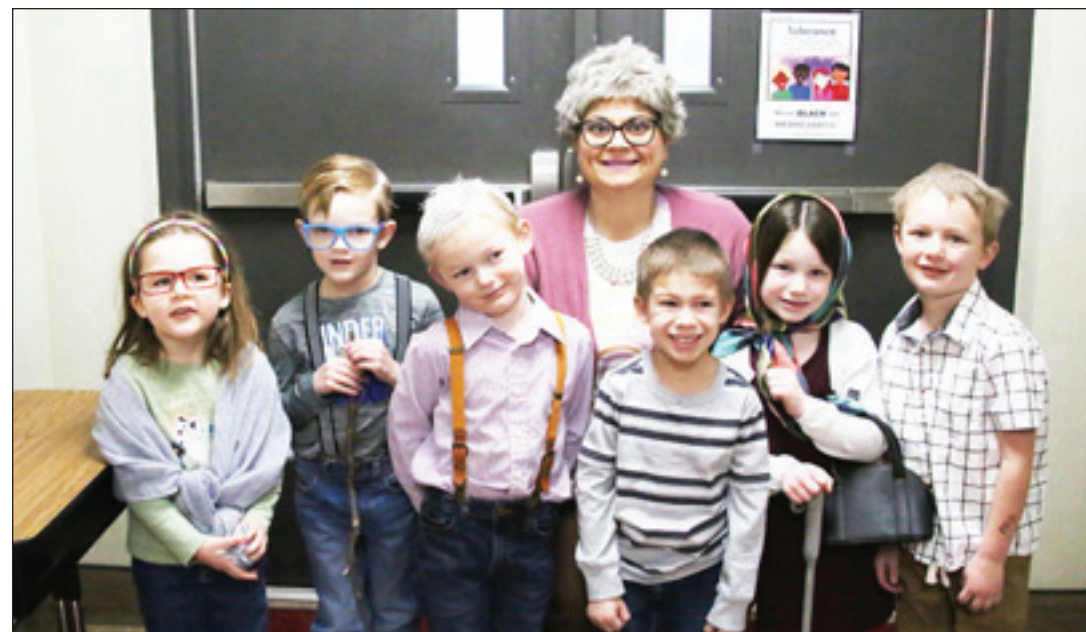
Fort Elliott Pre-K celebrated "100th Day of School" by dressing as 100 years old.