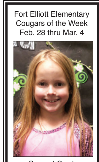
Fort Elliott Elementary Cougars of the Week Feb. 28 thru Mar. 4