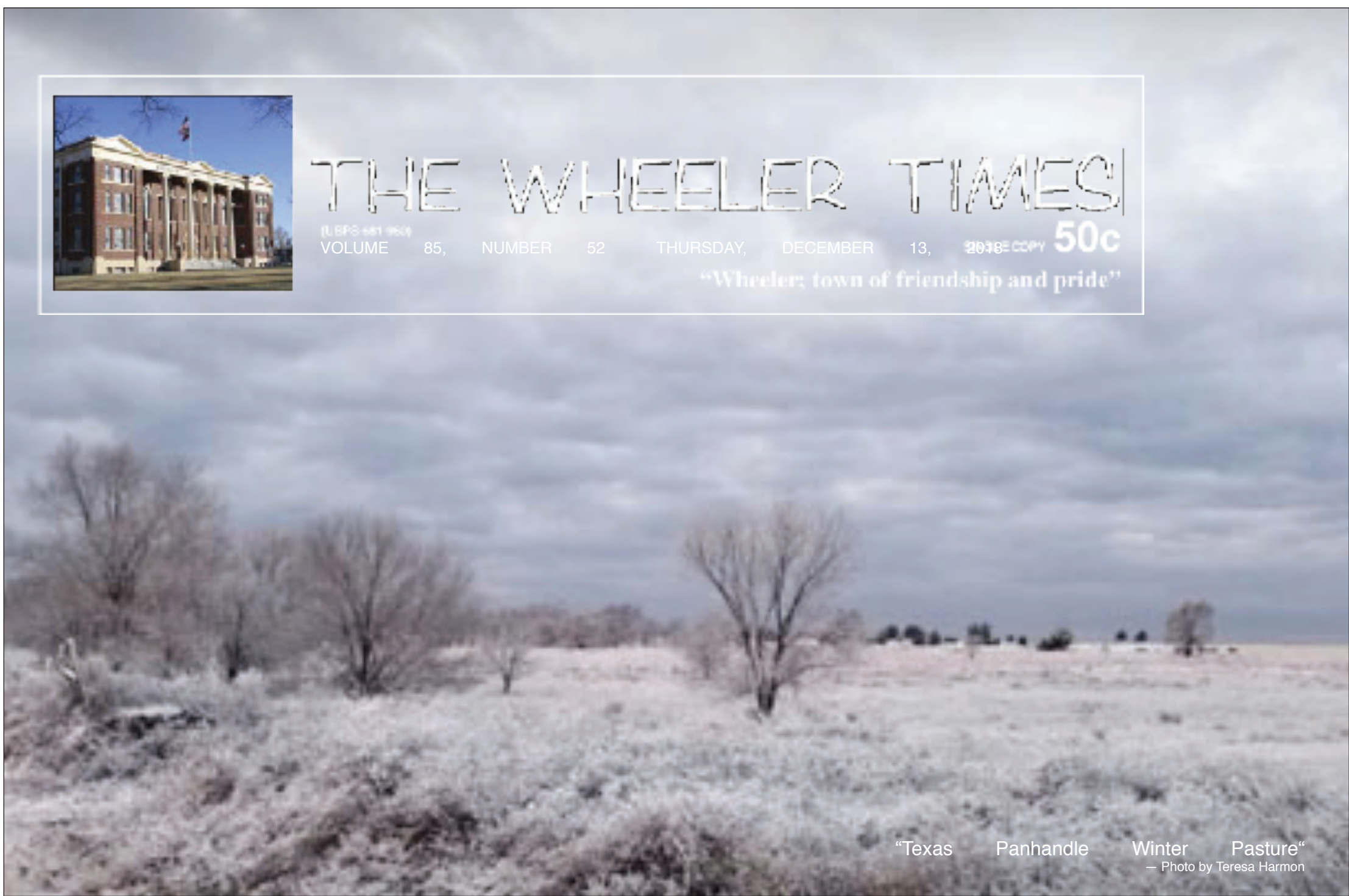
“Texas Panhandle Winter Pasture”