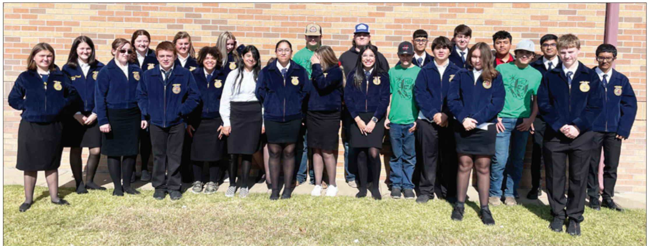
Kelton FFA recently attended the Area 1 FFA Area Leadership Development event held at West Texas A&M University in Canyon, TX.