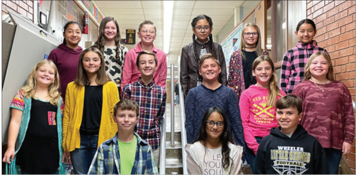
5th Grade UIL Participants