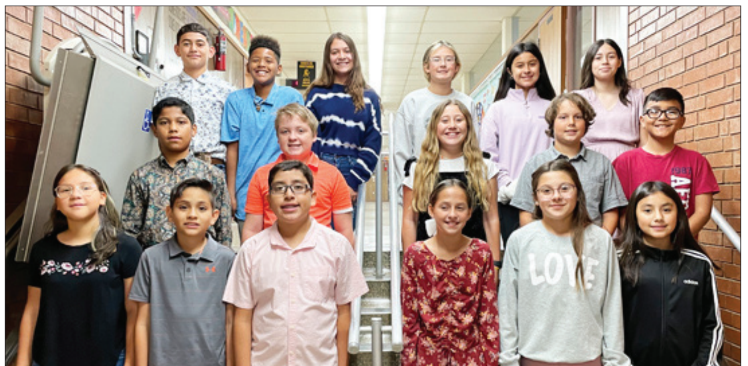
Sixth Grade U.I.L. Participants