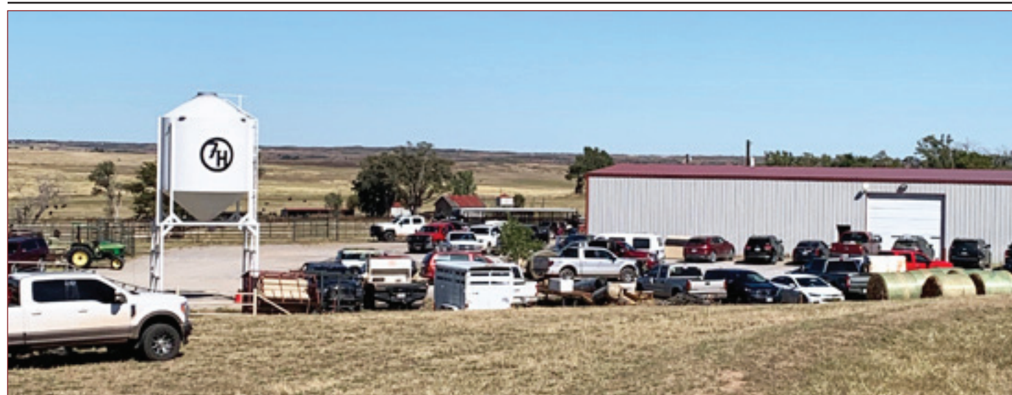
Large crowd at 7-H Production Sale.