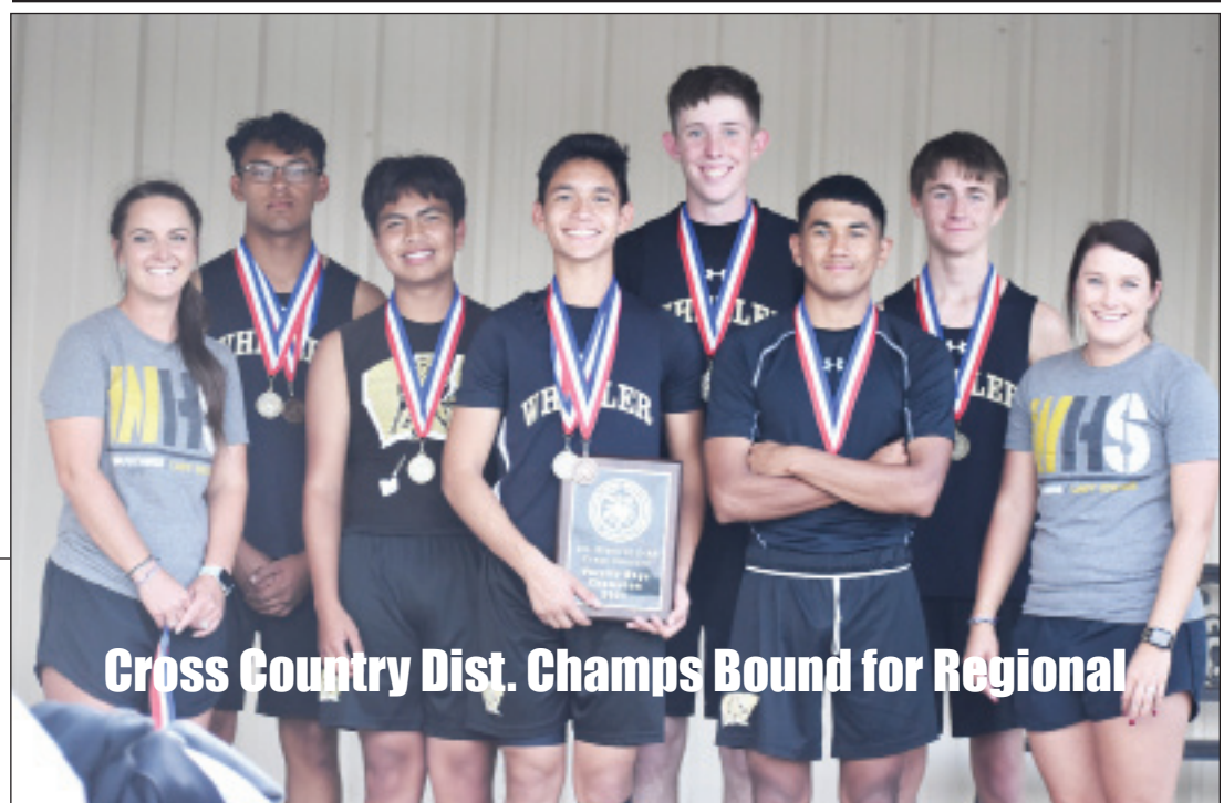
Cross Country Dist. Champs Bound for Regional