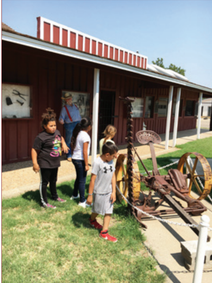
The Wheeler third grade enjoyed their time at the Panhandle Plains Museum