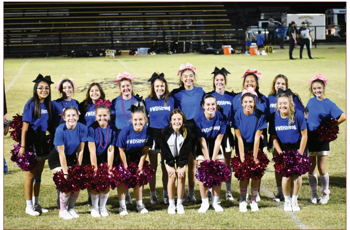
Memphis and Wheeler cheerleaders wear blue in honor of the White Deer Community Friday evening.