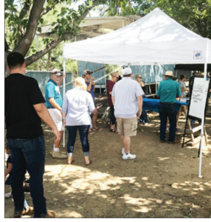
In line for ice cream