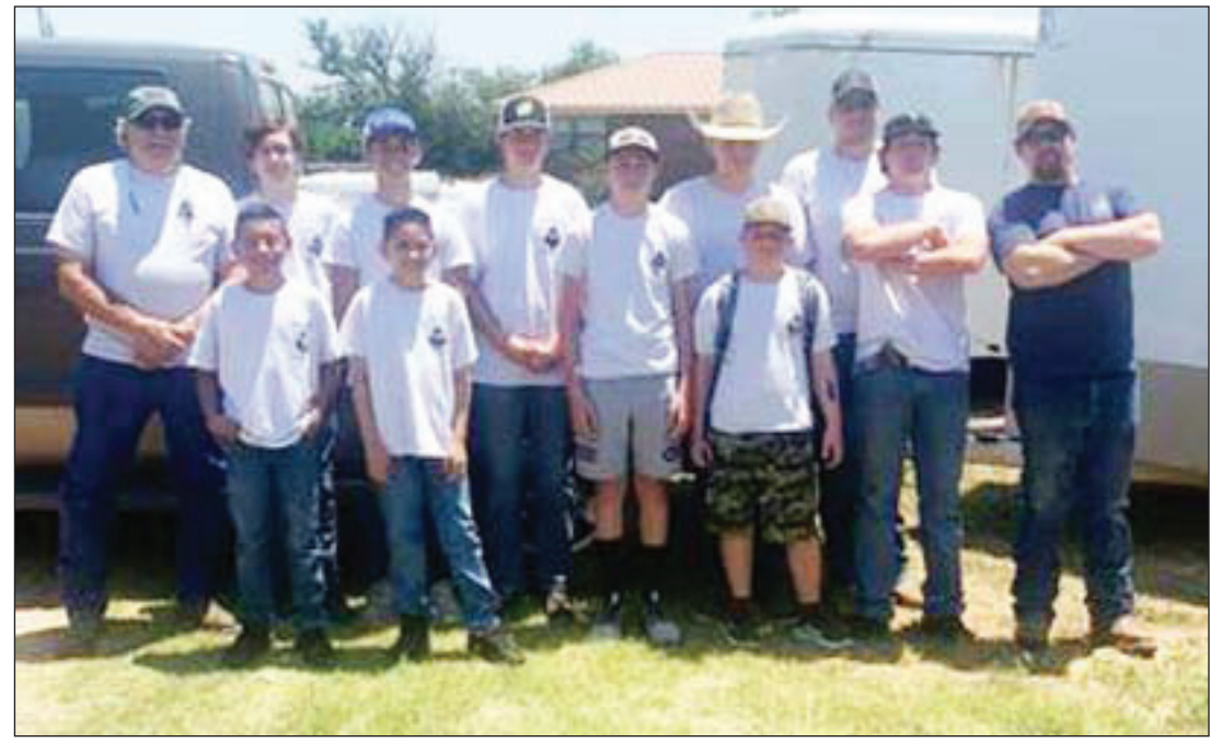
ATTENDING SCOUT CAMP: This group is representing Wheeler Boy Scout Troop 472 at camp.

Sunday Nite Live KPDR-FM, 90.3 ... Live from Wheeler 8:00 p.m. to 9:00 p.m.