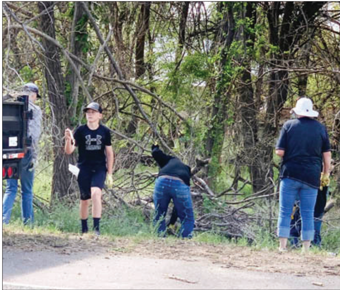
CITY-WIDE CLEANUP: On April 30 Wheeler's Junior High boys and girls helped by picking up limbs and trash.

Sunday Nite Live KPDR-FM, 90.3 . . . Live from Wheeler 8:00 p.m. to 9:00 p.m.