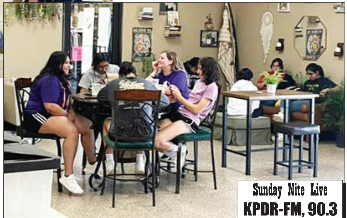
TAKING A BREAK: After working at the Wheeler Public Library, the seniors took a break at DeJa Brew.