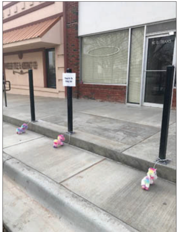
Some horses got tied to the hitching posts in front of the Times office the other day.

are there to be claimed, but attention must be paid in order to see them, or action must be taken in order to claim them, whereas maybe my attitude on Sunday is that such gifts are supposed to more or less fall into my lap. Not many things happen that way. So maybe Sundays play by the same rules as the other days, and it is I who do not. Therefore the folly is my own, not the structure within which I find myself. That itself is a pleasant discovery - if the folly is mine, the remedy can also be mine, although the knots I continue to put on my head testify to the slow pace with