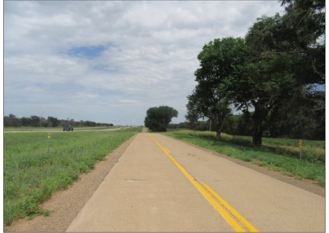
Route 66, south of Interstate 40, East of Shamrock

To learn more about the National Register of Historic Places, contact the THC's History Programs Division at 512-463-5853 or visit thc.texas.gov .