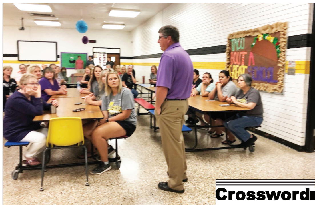
STAFF DEVELOPMENT MEETING: The Wheeler I.S.D. staff gathered last week for Staff Development meetings.