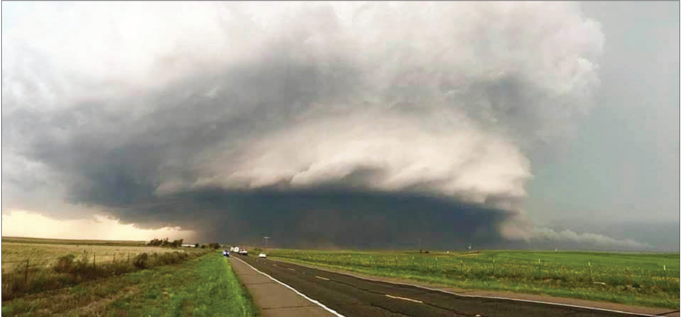
of the cloud near Mobeetie Sunday afternoon, August 16, 2020. No measurable rain amount was reported.