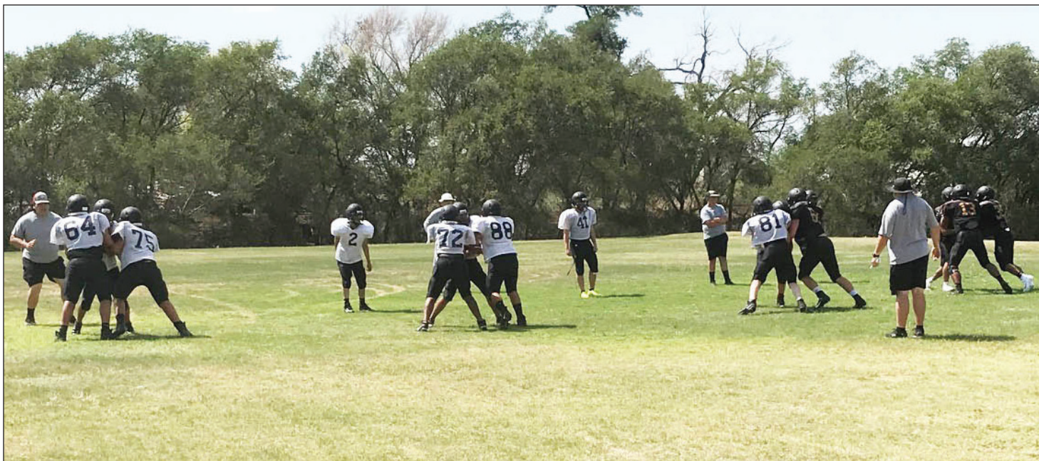
Our 2020 Mustangs are in "two-a-days" getting ready for the 2020 football season; their first and only scrimmage this year is Friday, August 21 at Munday.

Good luck at school, everyone! Have fun and be safe! That's it!