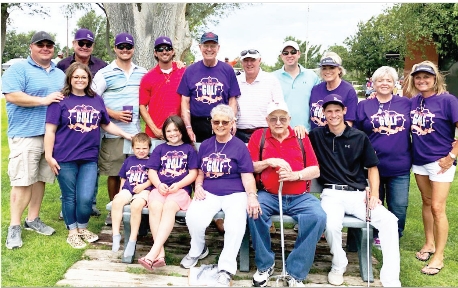
Jennings family members able to attend the tournament.