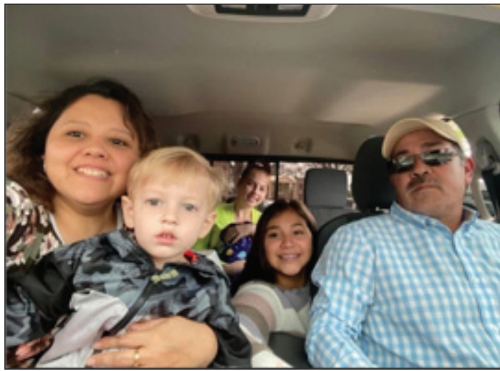
The Badillo Family