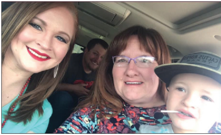
The Hawleys Family