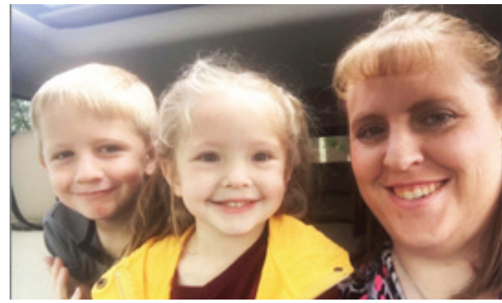
The Hathaway Family