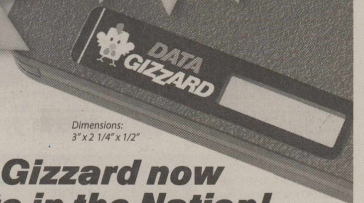
Dimensions: 3" x 2 1/4" x 1/2"

FREE** Data Gizzard come in and find out how!