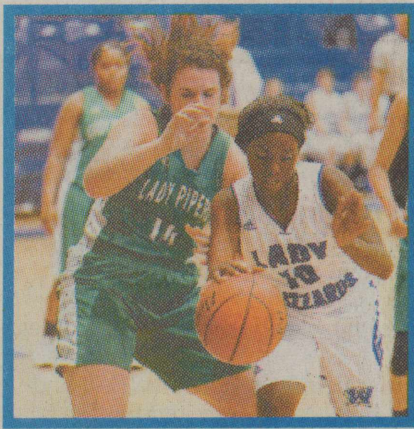
Lady Blizzards fall to Hamlin SEE PAGE 8