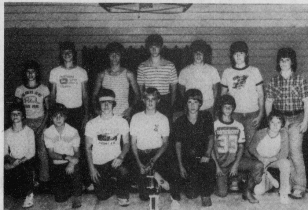
FIRST PLACE-The Blossom Junior High School 7th grade track team placed first at the Rivercrest Track Meet on April 16. The seventh and eighth grades individually won 53 ribbons.

finest botanically named horticulture exhibit in the show. All exhibits are