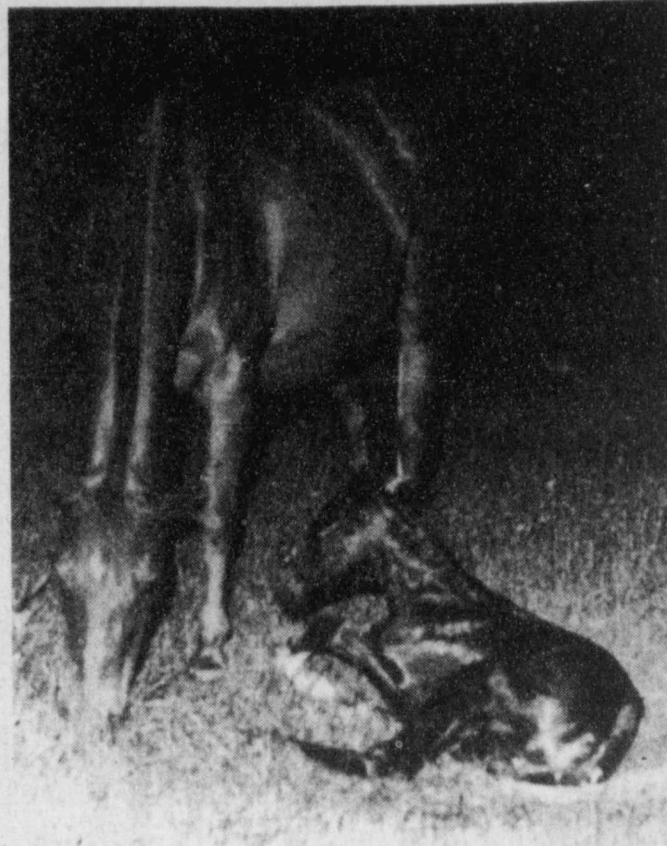
NEWBORN-this foal is minutes old, but already thinking about getting up and finding his first meal.