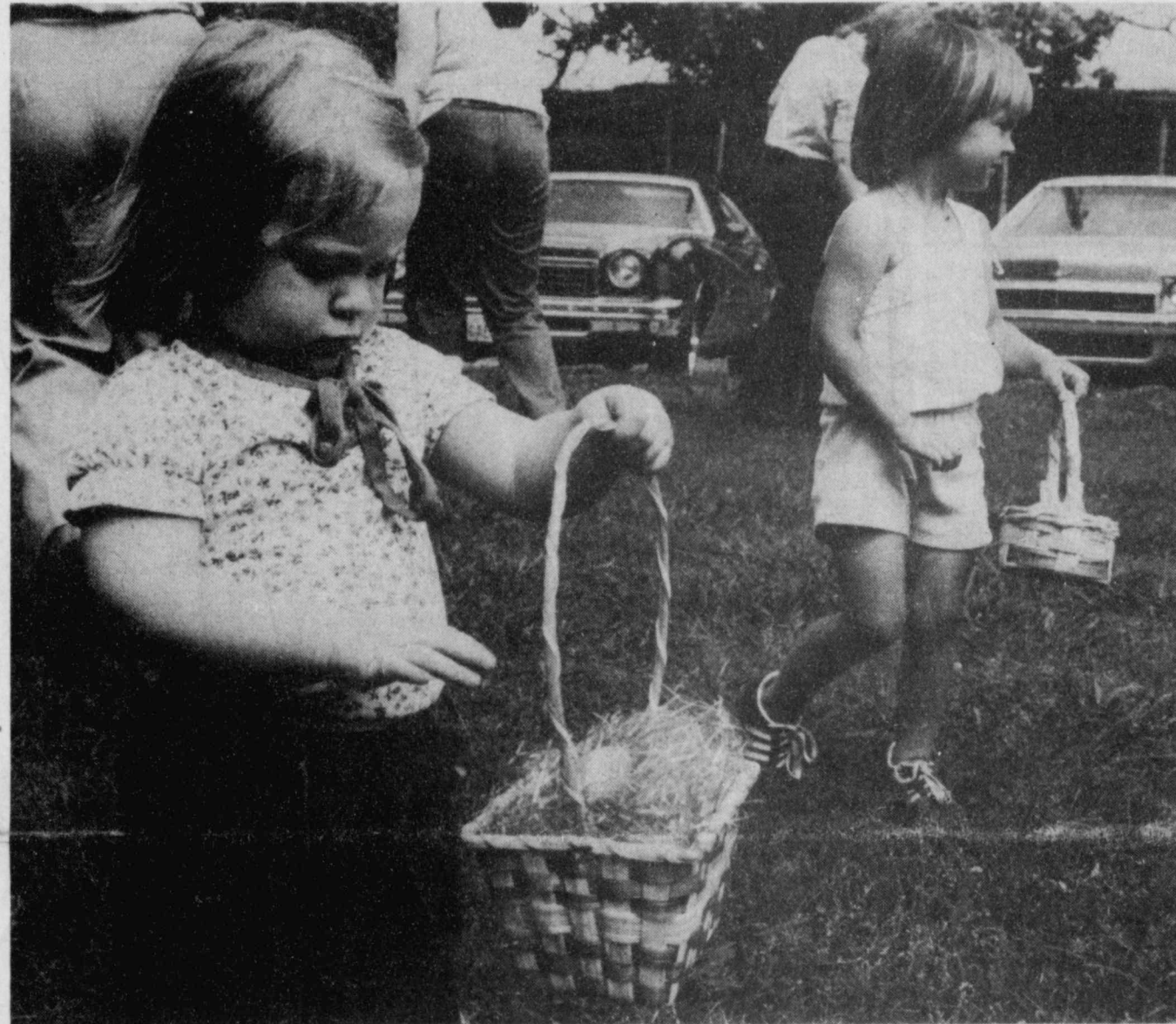
EASTER HUNT-what could be finer than a spring afternoon, lots of Easter eggs and lots of