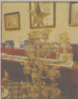
Shampoo and hair conditioner bottle caps were used to decorate this tree.