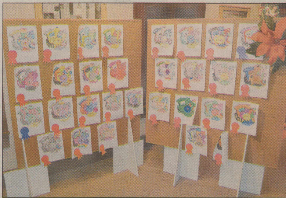
Christmas art decorating the second story, by First Grade students.