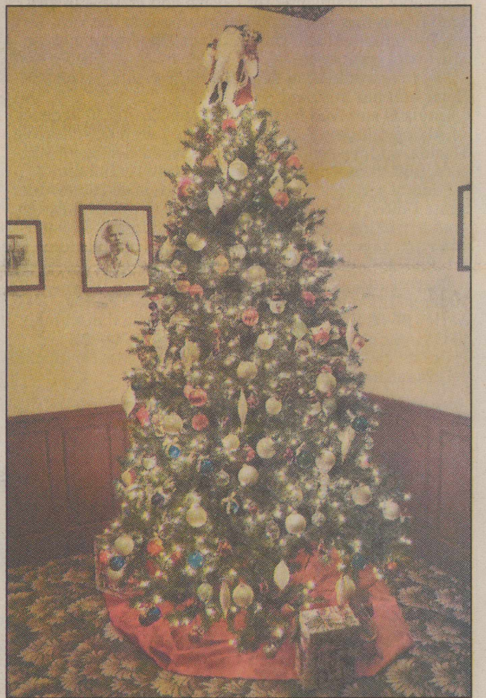
The Lobby Tree, a gentle giant put up by the women of the Rock Hotel, each year greets visitors under a different theme.

Some of the trees included in this year's exhibit are the Bride and Groom Tree, set up at the Bridal Room by the women of the Rock Hotel. The Charlie Brown