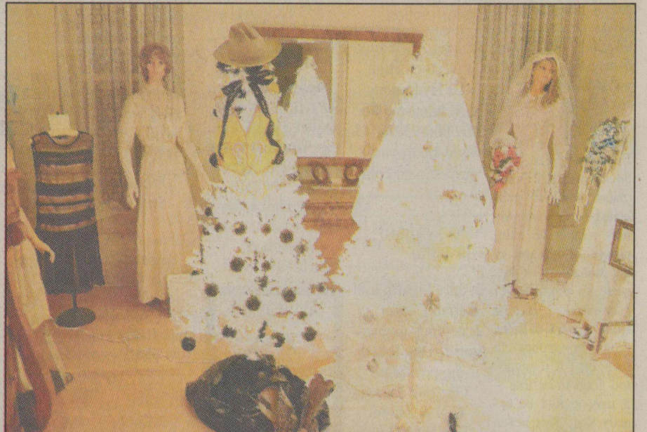
The Bride and Groom Christmas Tree set, put up where else, at the Bridal Room.