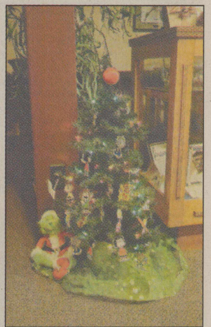
A little Grinch lurks underneath the Charlie Brown tree.