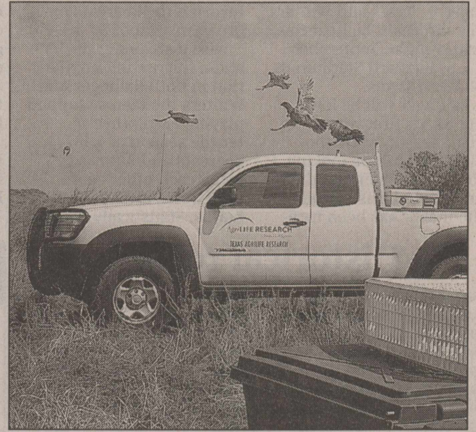
Bobwhites, several fitted with radio transmitters, are released at the Rolling Plains Quail Research Ranch as part of a research effort.

Go to the ranch's website at http://www.quail-research.org for program updates.