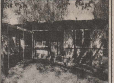
214 Paloma, Winters, Texas - 3 bdrm/2 bath, dining room, nice kitchen, pecan trees, 576 sq. ft. metal shop with attached carport.