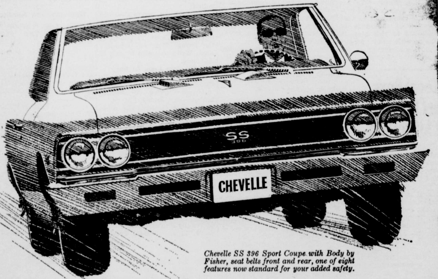
Chevelle SS 396 Sport Coupe with Body by Fisher, seat belts front and rear, one of eight features now standard for your added safety.

For the guy who'd rather drive than fly: Chevelle SS396