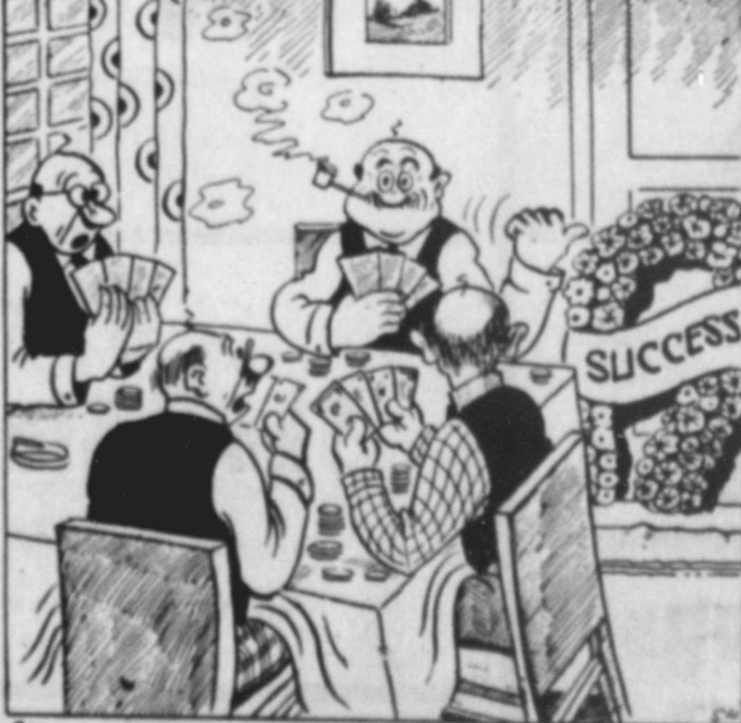
"THAT'S FROM MY WIFE! SHE WANTS A NEW FUR COAT!"